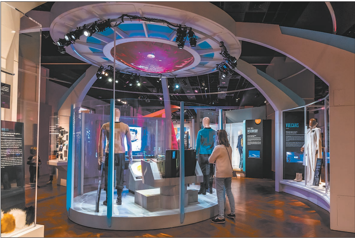
The Henry Ford Museum in Dearborn has a Star Trek exhibition that explores history of the TV franchise.

Rare costumes, including the Spock tunic worn by Leonard Nimoy, Lt. Uhura’s (Nichelle Nichols) dress, Khan garments past and present such as the open-chest tunic worn by Ricar-