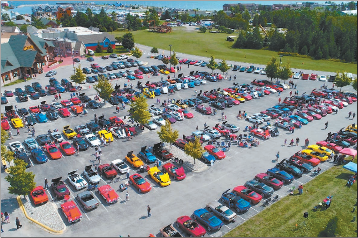
This special festival in Mackinaw City is just one of many events in Michigan that celebrate the Corvette.

“People's choice style of judging will determine winners in several different award classes. Winners will be announced at an awards presentation at 3 p.m. Saturday's festivities will culminate with a parade of Corvettes across the Mackinac Bridge, beginning at 7 p.m. All Corvettes are welcome and there is a nominal fee for non-show registered Corvettes.”