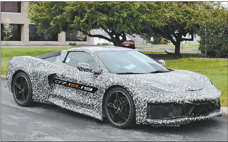
The public will get to see the actual Corvette on July 18.