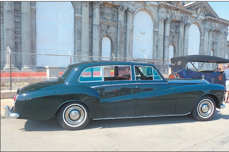
This 1961 Rolls Royce Phantom V was one of the Concours preview cars.