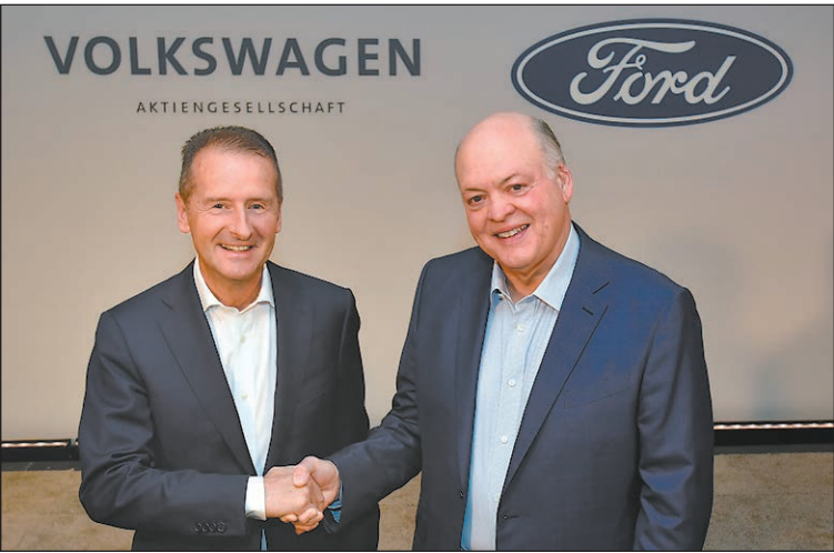
Diess, left, and Hackett formalize the new Ford-VW alliance.