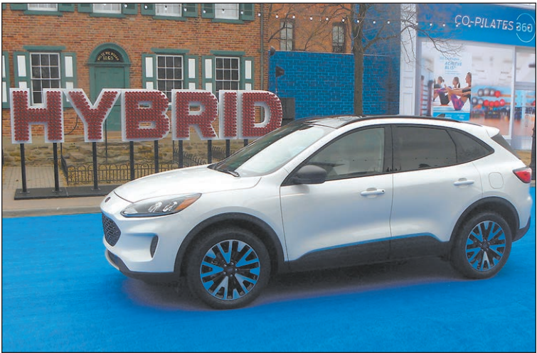
2020 Ford Escape