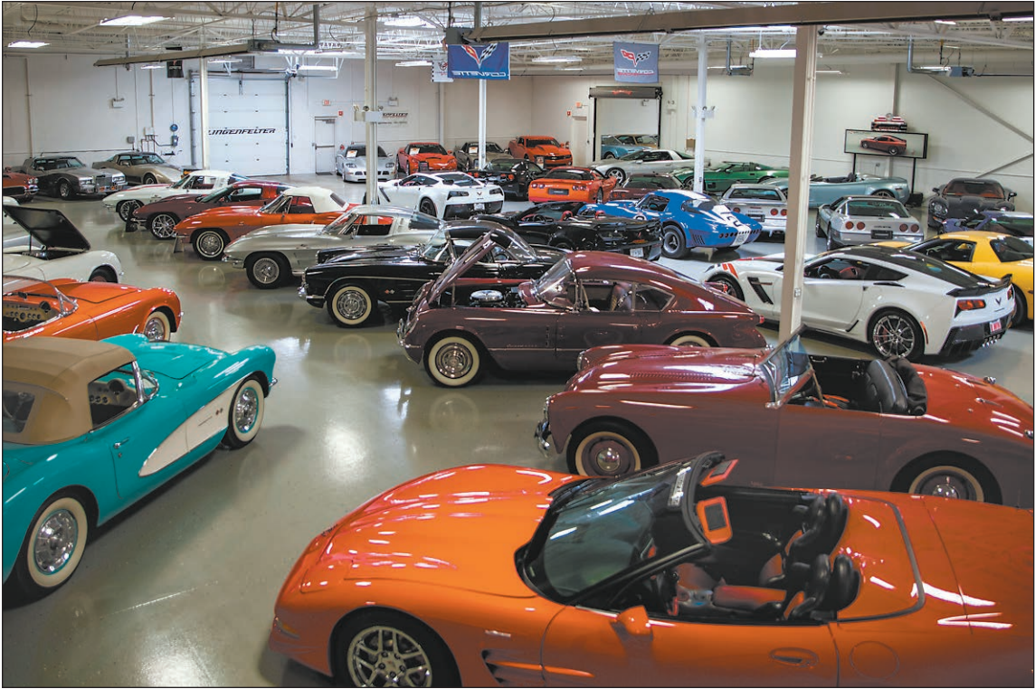
The Lingenfelter collection of classic cars will be available for viewing to help the American Cancer Society.