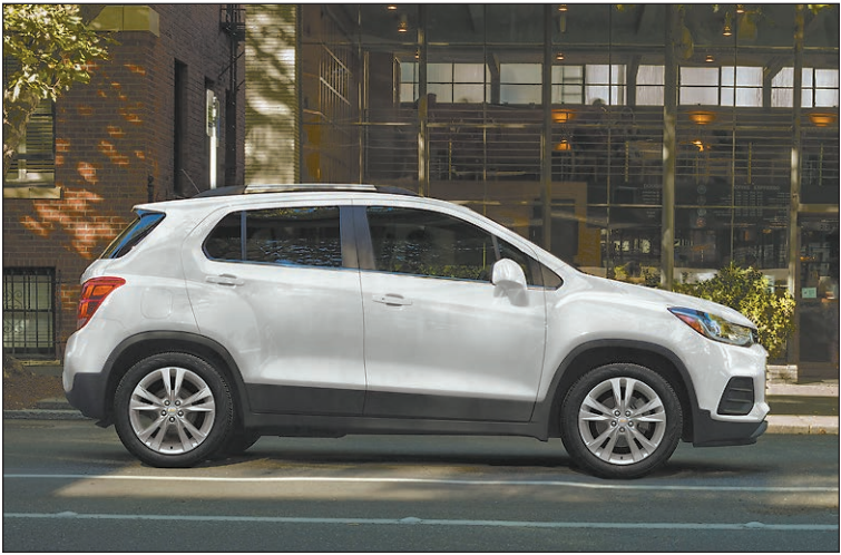
2019 Chevrolet Trax