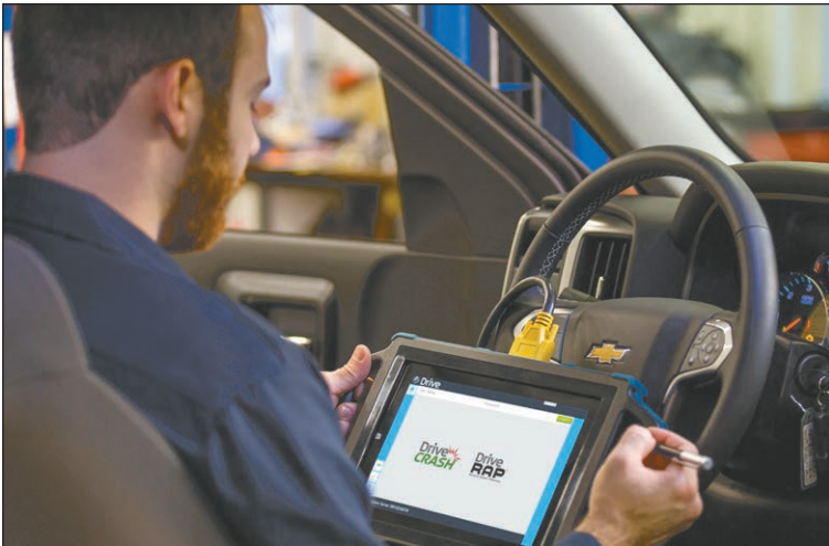
GM uses Drew Technologies' DriveCRASH for Collision Repair Network.