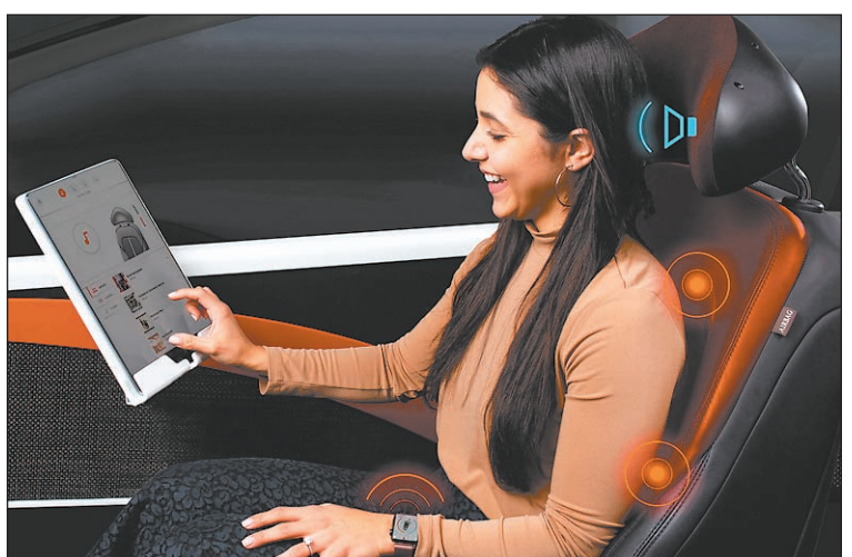
Lear showed off its latest seating technology at the Geneva auto show.