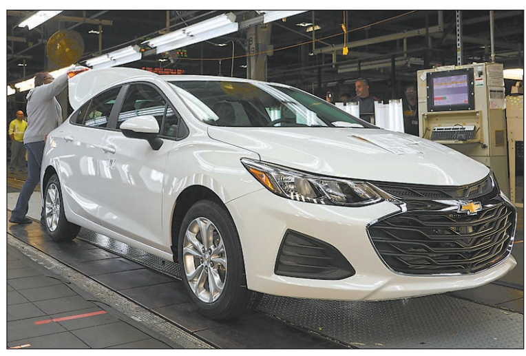
This is the last Cruze that was assembled at GM's Lordstown plant.