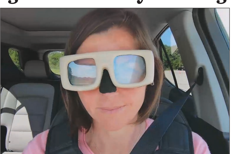
This geat used by a GM engineer recreates the effects of drowsy driving.