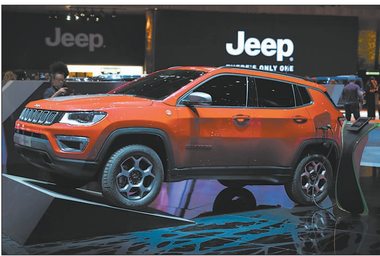
This Compass comes with plug-in hybrid technology, a first for Jeep.

The electric units work in synergy with the new 1.3-litre turbo petrol engine to increase efficiency and power overall, he said. For the Renegade, the power sits in the 190 and 240 hp range results in outstanding on-road performance, said Gavilan. 0-100 km/h is reached in approximately 7 seconds. The same figures although still pending homologation - are achieved by the first plug-in hybrid Compass. Also, on the Compass, the simultaneous action of the internal combustion