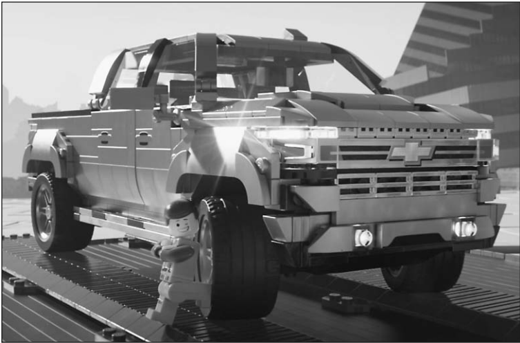
Chevy and LEGO have made an "awesome" partnership.

30-second version will also run in Spanish in target markets. Chevrolet unveiled the full-size LEGO Silverado at the North American International Auto Show last month. These new ads are part of the Silverado advertising and social media blitz that continues through the first half of 2019.