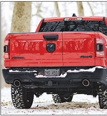
Dual side-hinged tailgate

"The Ram multifunction tailgate is intuitive to operate and owners will find it immediately useful," said Bigland. "Combined