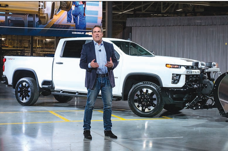
The 2020 Silverado HD joins the new GMC Sierra in the GM portfolio.