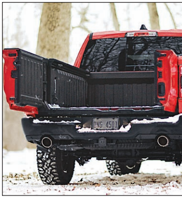
Doors open wide, not down