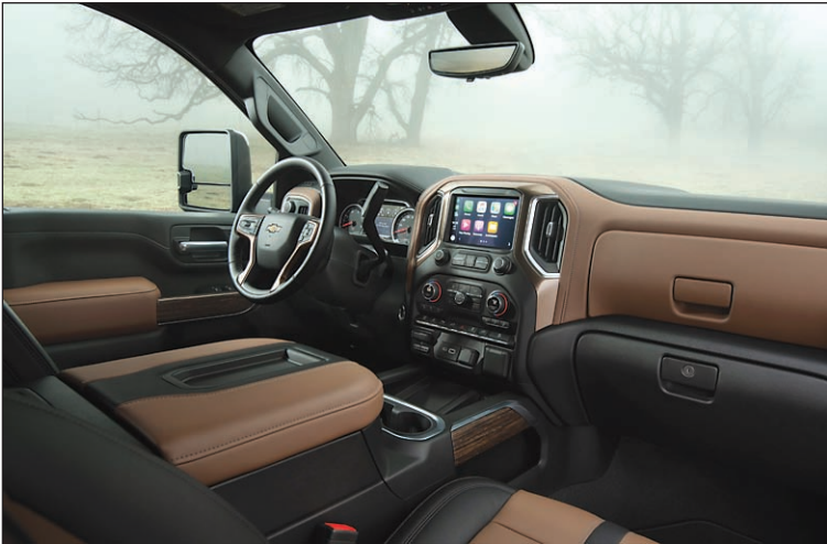
The new Silverado HD may be strong, but it doesn't stint on comfort.

The HD-exclusive sculpted exterior design features the most differentiation from the Silvera-