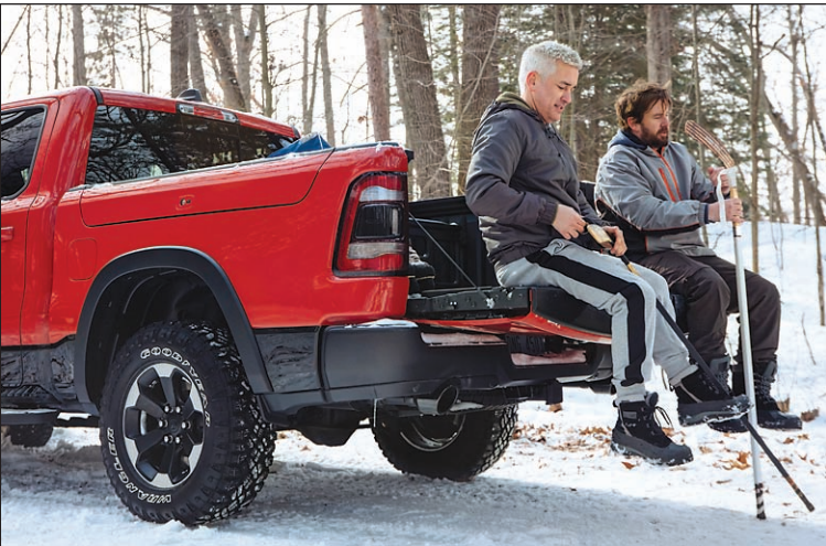
The Ram 1500 tailgate now comes in many shapes and sizes.