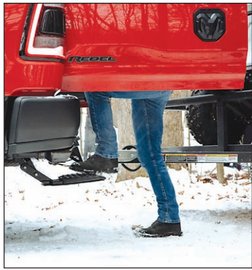
Retractable center-mounted step

with Ram's class-exclusive RamBox feature and new tailgate step, we're taking Ram's cargo management and storage to the next level."