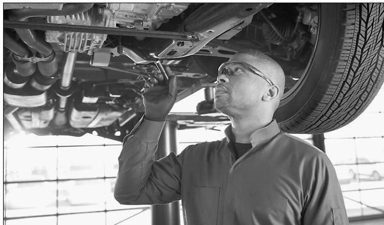
GM now is offering a true extended bumper-to-bumper limited warranty.

GM's new warranty program differs in several important ways from service contracts, which are a popular way to protect against unexpected repairs, Kass-Shamoun said.