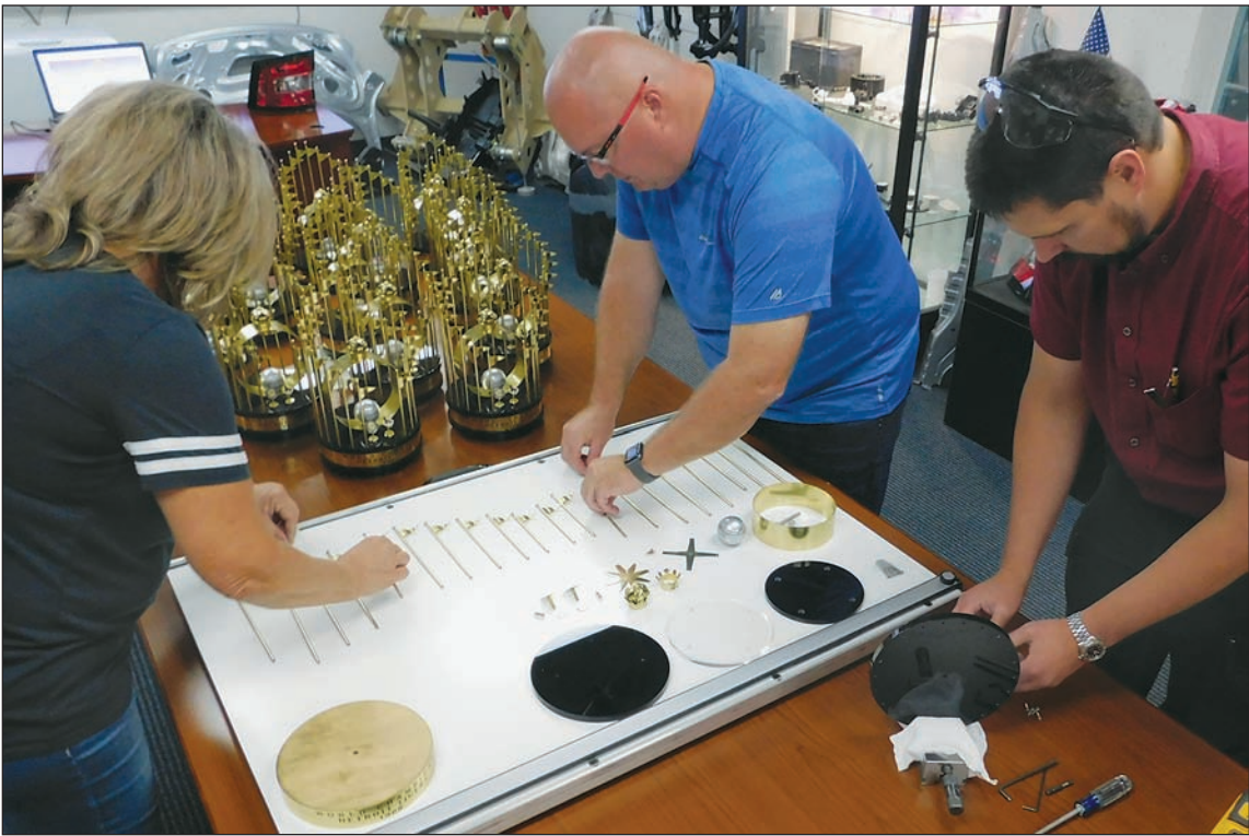
3-Dimensional employees prepare replica World Series trophies for the surviving 1968 Tigers.

Because of QUANTUM's smart design, engineers were able to eliminate the need for shims.