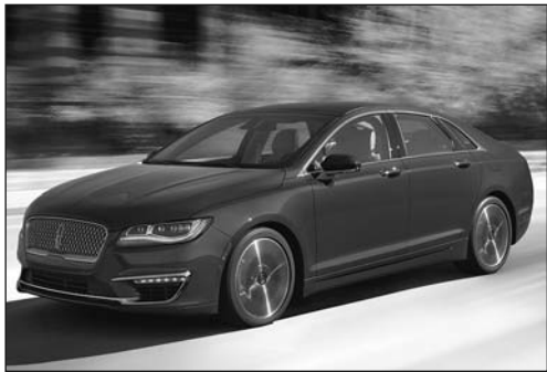
2017 Lincoln MKZ Hybrid