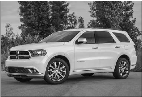
2019 Dodge Durango