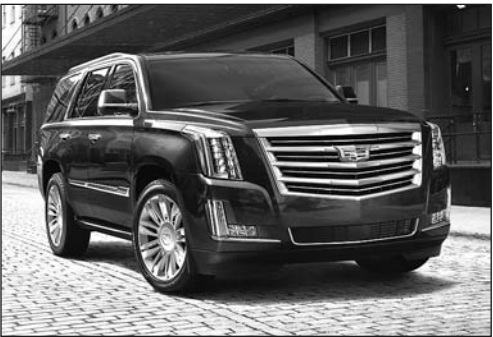
2018 Cadillac Escalade