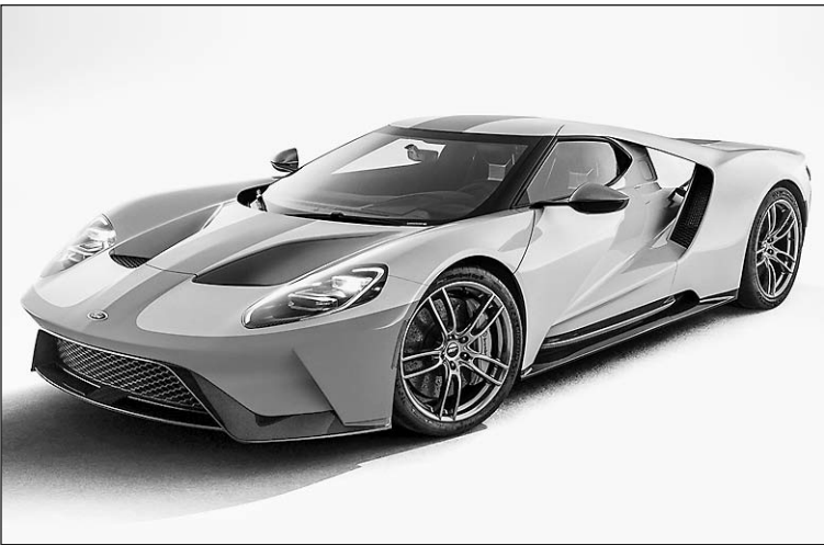
Ford is raising the production numbers for the 2019 GT supercar.

Germany's transportation ministry said that it had found four instances in which emissions were turned off in the affected models, and that Opel had dragged out a voluntary recall to fix them to the extent that only 70 percent of those vehicles have had their software adjusted to lower emissions.