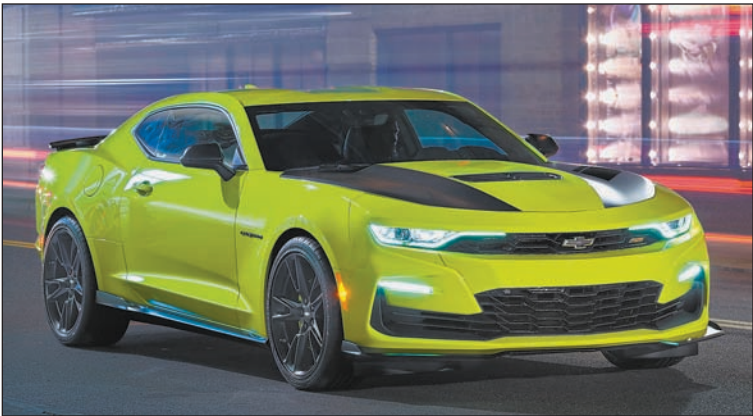
The 2019 Camaro's new Shock exterior color is available early 2019.

New front-end styling on LS, LT and SS models, including the fascia, grille, dual-element headlamps, hood and new LED signature lighting, puts a new face on the 2019 Camaro. The ZL1 model retains its airflow optimized front-