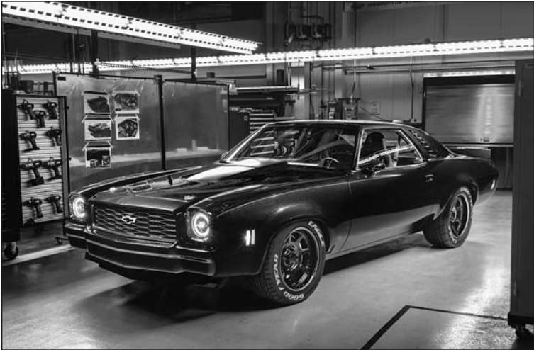
1973 Chevy Chevelle Laguna contains the new LT5 crate engine.

That racing heritage inspired the build of this show car, which features the new LT5 6.2L supercharged crate engine. It's based on the engine that drives the