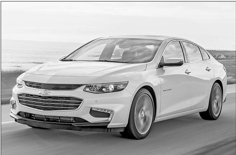
2016 Chevrolet Malibu

savings by category can be found on three-year-old luxury midsize cars, sports cars and large cars, with savings of 48 percent, 45 percent, and 43 percent respectively when compared to their new counterparts. Conversely, three-year-old midsize trucks, luxury large cars and large trucks offer the least amount of savings, averaging 27 percent, 30 percent and 33 percent in savings compared to their new counterparts. “Luxury midsize cars serve as an example of the used market providing significant savings since these vehicles often have the highest lease penetration rate of any vehicle category,” said Drury. “On the other end of the spectrum, midsize trucks is a category that has been invigorated on the new sales front with the resurrection of old models, but leasing has never been popular among these shoppers. And with such limited quantities on the used market, midsize trucks retain high values, making them less appealing from a savings perspective.” Edmunds analysts also sampled values of three-year-old vehicles compared to new for the 20 top-selling used vehicles in the United States. This analysis reveals that greatest savings can be found on the BMW 3 series, Chevy Malibu, and Chevy Cruze,