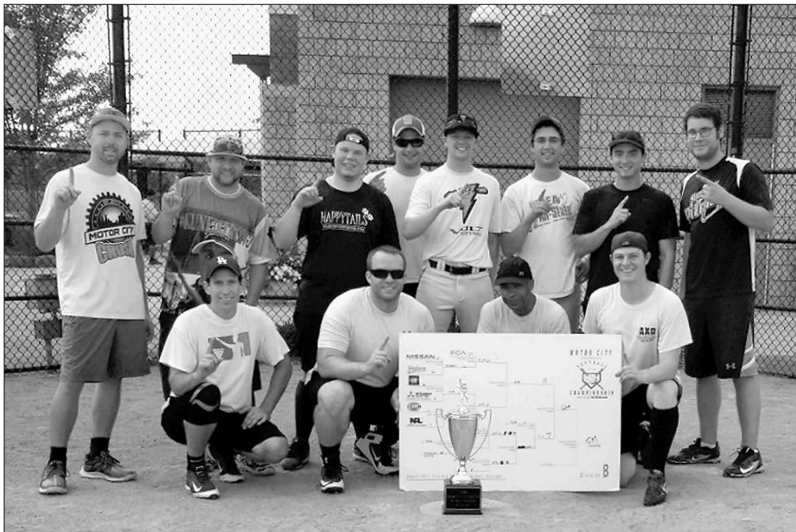
The Tech Center's B team also won its bracket at the recent Motor City Automotive Softball Championship.