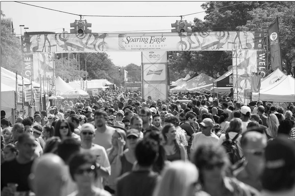
The Ford Arts, Beats & Eats festival is set to begin on Labor Day Weekend and will feature new attractions.

Life Time will make its return to Ford Arts Beats & Eats with new classes all weekend long for