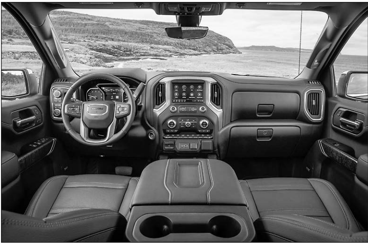
2019 GMC Sierra Denali interior

The 2019 Sierra Denali affirms its position as the most premium Sierra ever, with segment-leading technologies and exclusive features, including: