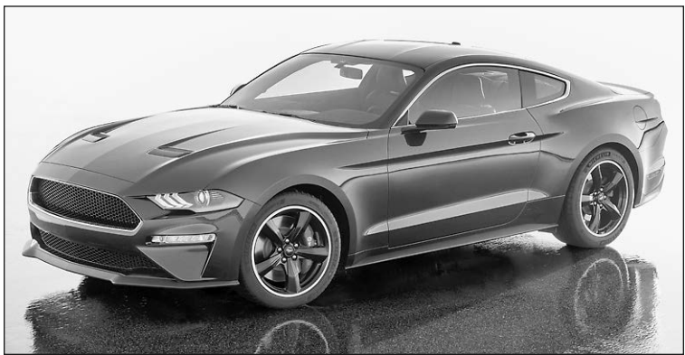
This Kona Blue Bullitt Mustang is going to help kids with diabetes.

For those unable to attend the cruise, raffle tickets also are available online at onecause.com/jdrfbullitt until Nov. 8; online orders end Nov. 9.