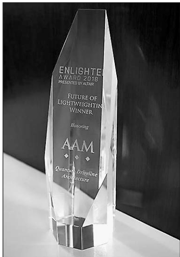
AAM's Enlighten Award

QUANTUM can be adapted for use on virtually any size truck or