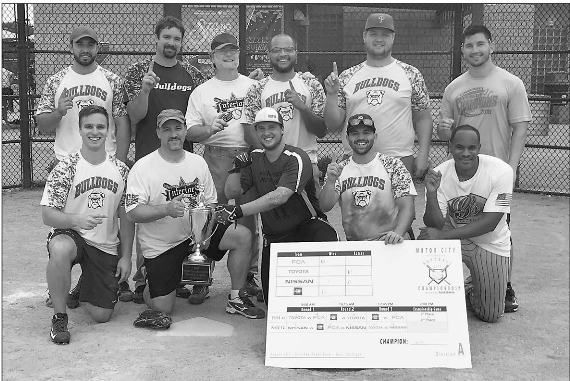
The Tech Center's "A" team won its bracket at the recent Motor City Automotive Softball Championship.