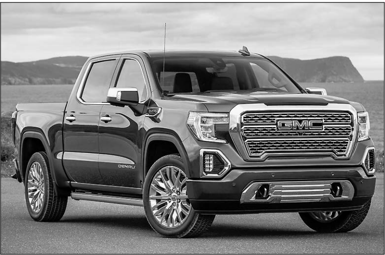
2019 GMC Sierra Denali

The new Sierra Denali is offered as a crew cab, with nearly 3 inches of additional rear-seat legroom compared to the previous model. That roomier cabin is trimmed with Denali-exclusive materials, including premium Forge leather-appointed seating, authentic open-pore wood trim and dark-finish aluminum decor.