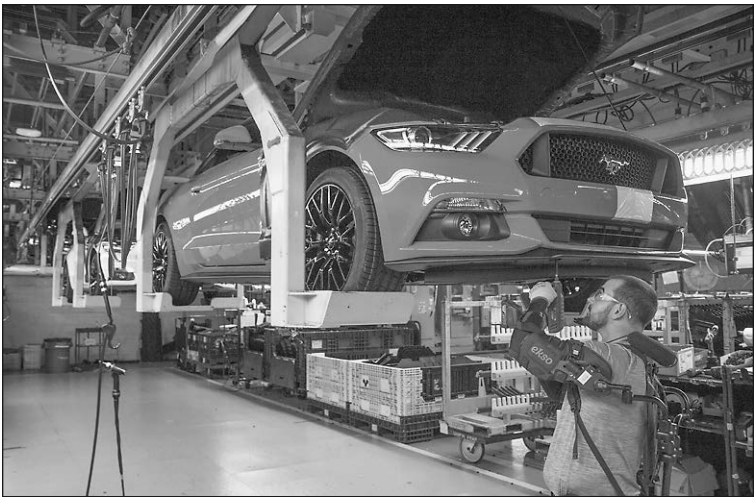
Ford's EksoVest is used to reduce the physical toll on employees.