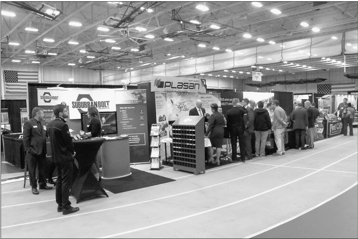
CONTINUED ON PAGE 3 More than 100 Michigan companies showed how they can help the military at the recent MDEX gathering.