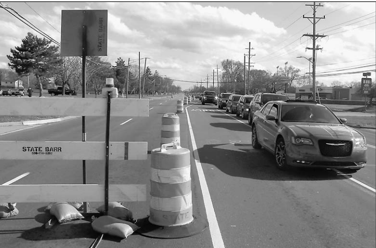
Hoover, from 11 to 13 Mile, is under going repairs for several months.