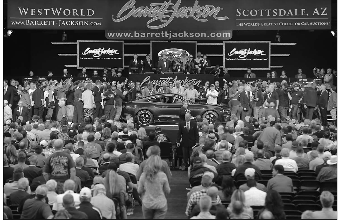
Interest was high for the Ford-donated limited edition "Bullit" Mustang sold recently at auction for charity.