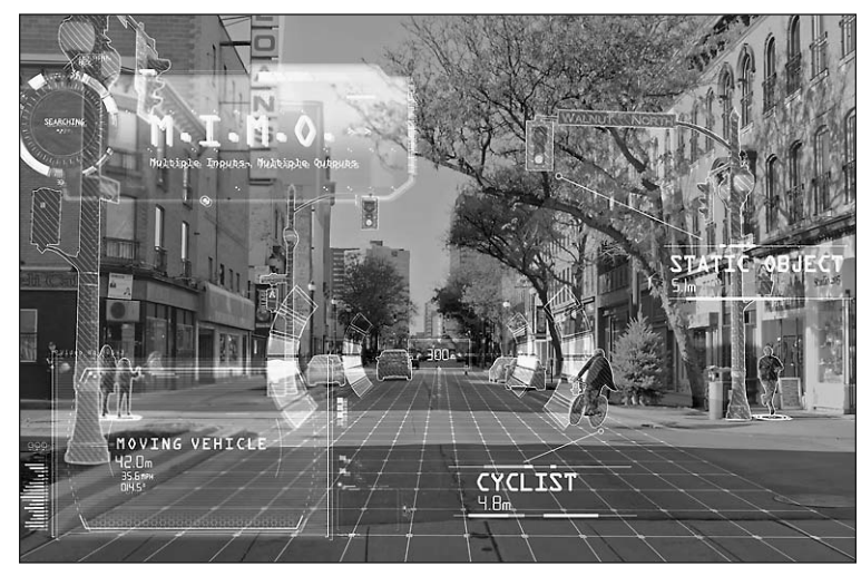
An image of how Magna's Icon Radar scans appear.