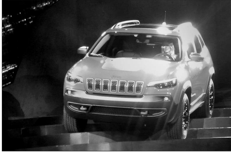
The 2019 Cherokee, unveiled recently, competes in largest SUV segment.