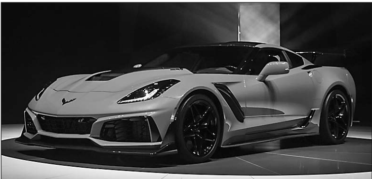
The fastest production Corvette ever – the 755-horsepower 2019 ZR1.

The Corvette ZR1's exclusive LT5 supercharged engine, which is rated at an SAE-certified 755 horsepower and 715 lb.-ft. of