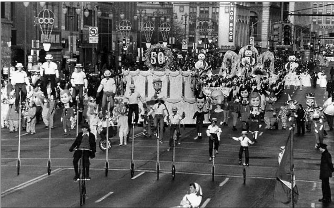
A photograph from history: Detroit's 50th Thanksgiving Day Parade.