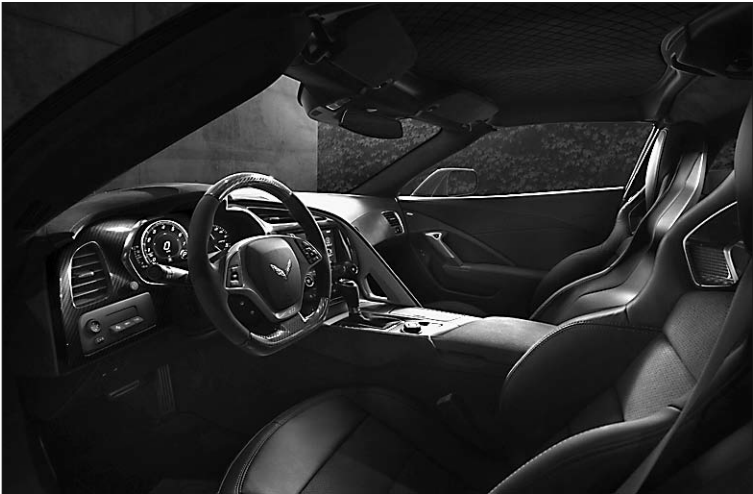
The 2019 Corvette ZR1's interior

The adjustable High Wing is part of the new ZTK Performance Package, which also includes a front splitter with carbon-fiber