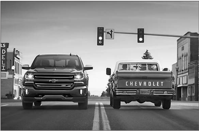
A 2018 Centennial, left, is posed next to a 1972 Chevy C10 pickup truck.