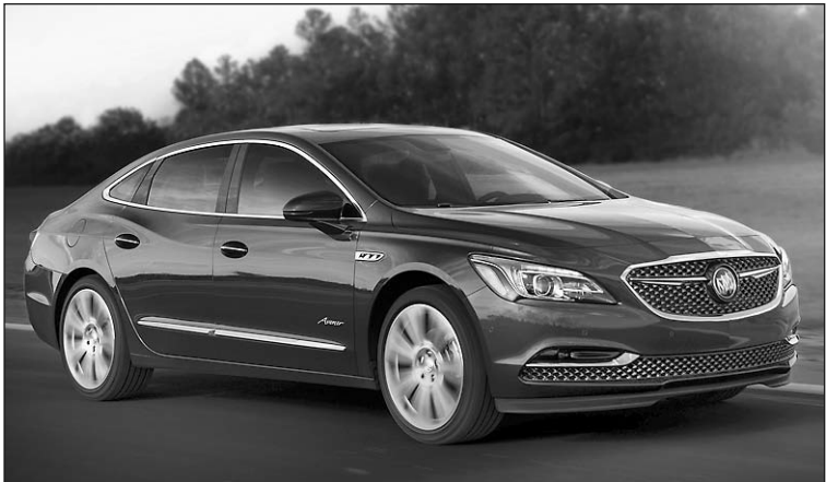
The 2018 Buick LaCrosse Avenir exterior shows refined design.