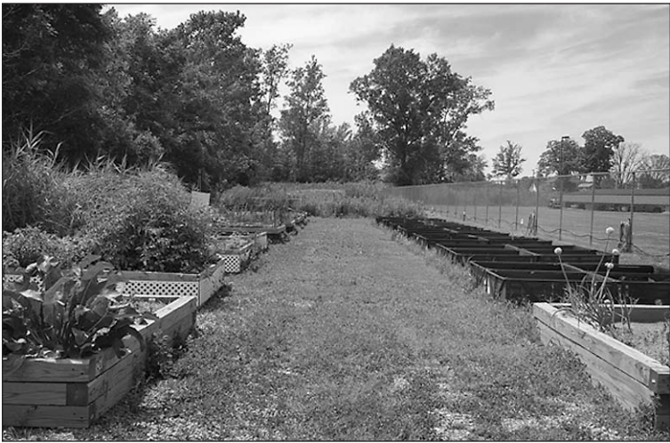
Shipping crates have been repurposed at GM's Brownstown garden.

Altogether, General Motors manages more than 5,000 acres of wildlife habitat in 14 different