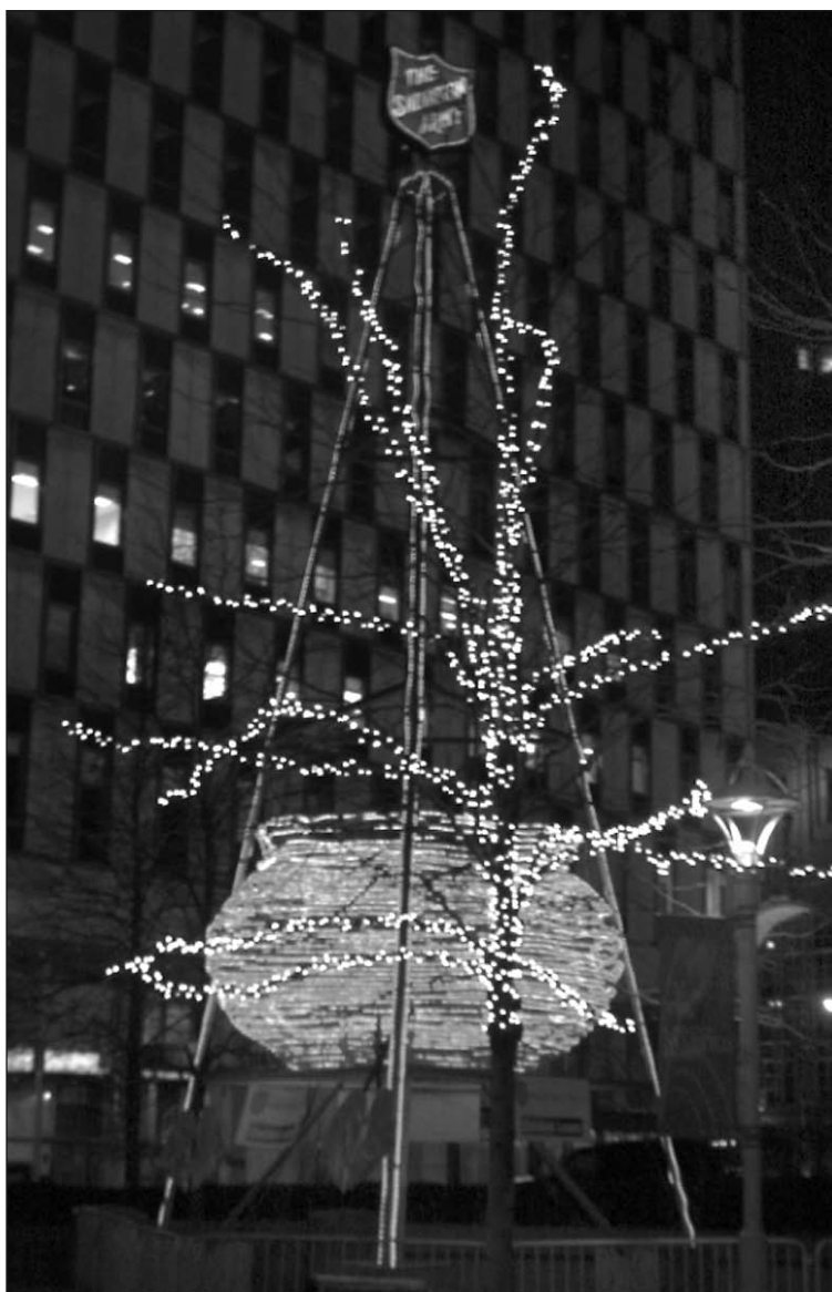
The annual Salvation Army Kettle in downtown Detroit