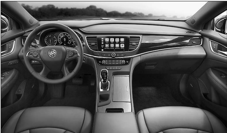
The 2018 Buick LaCrosse Avenir interior emphasizes luxury.