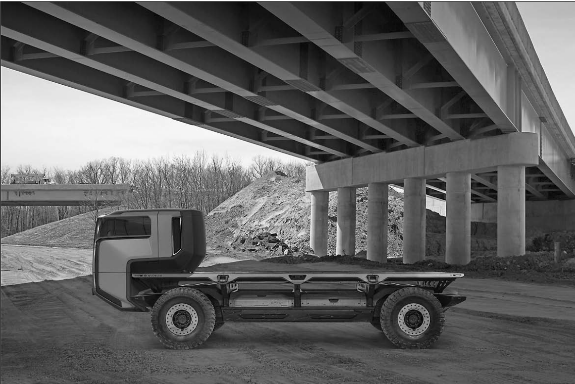
A rendering of the SURUS platform with a truck chassis that GM is working on for the U.S. Army.