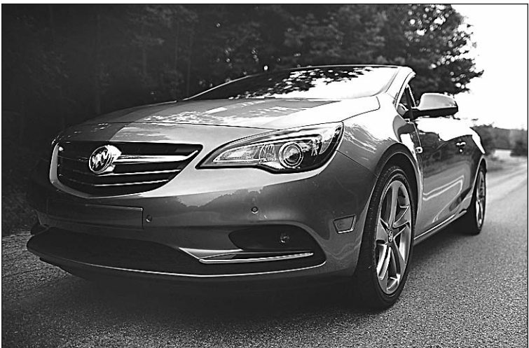
2017 Buick Cascada convertible rates high in reliability.