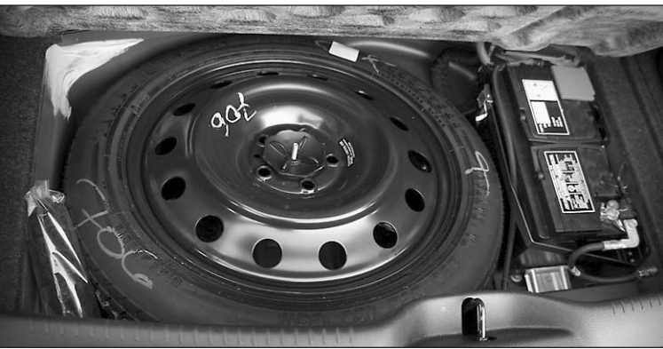
Spare tires like this are becoming rarer in today’s automobiles.

But GM said it has invested $800 million in the Ingersoll plant, a move that the company said should show workers it plans to keep producing vehicles there. The company said it didn’t want to agree to a main factory designation because it needs flexibility to respond to market conditions. Production of the Chevrolet Equinox compact SUV restarted at 11 p.m. Oct. 16.