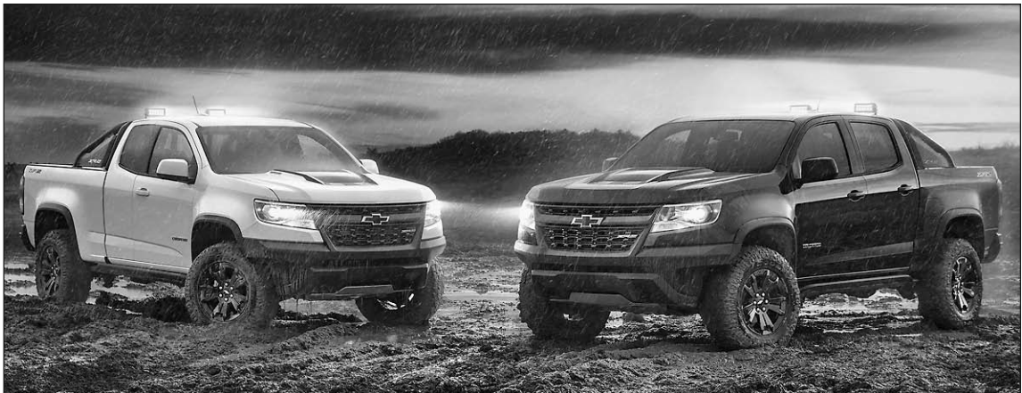
(L to R) 2018 Colorado ZR2 Dusk and ZR2 Midnight Editions will be shown at the SEMA show in Las Vegas.