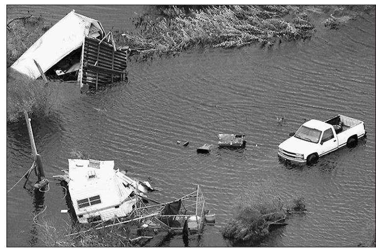
Many vehicles were stuck on flooded roads during the disaster.

As to the effect on sales, Hopson said that, in the short term, those affected by Harvey will