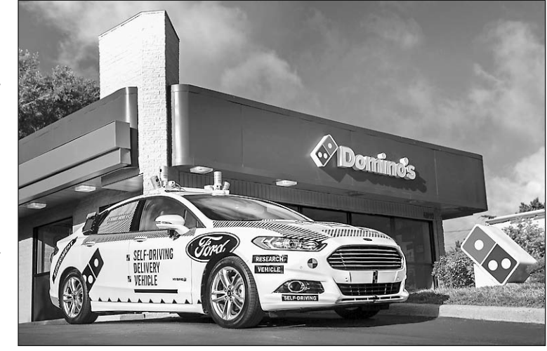
Ford and Domino's are working on autonomous delivery cars.