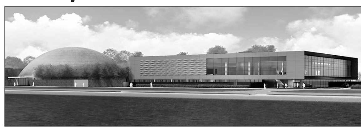
A rendering of the GM Design Center once construction, set to begin in 2018, is completed.

ter campus investment has included new construction, significant renovations of some existing facilities and the expansion of some operations, Henderson said. Construction began in May 2015.