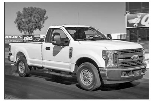
2017 Ford F-Series Super Duty