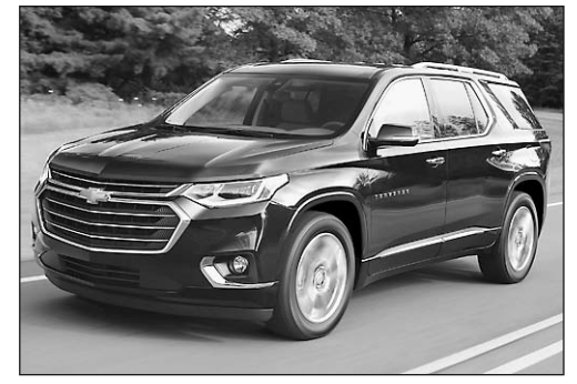
2018 Chevrolet Traverse