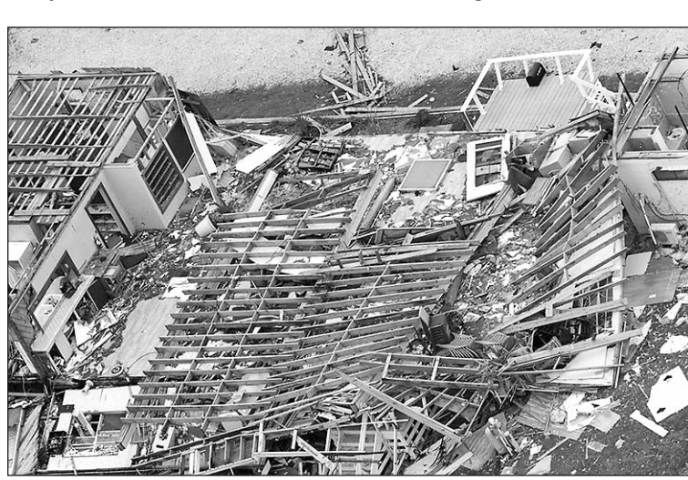
Destroyed businesses could affect how fast Houston recovers

probably be too busy doing other things to go out and buy cars.