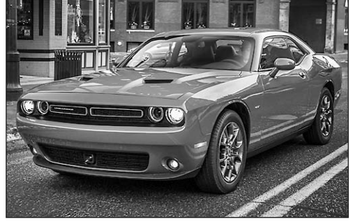
2017 Dodge Challenger