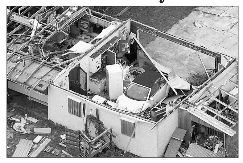
Cars and homes were destroyed by Hurricane Harvey.