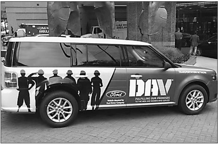
A 2017 Flex is one of the vehicles Ford has donated to the DAV.