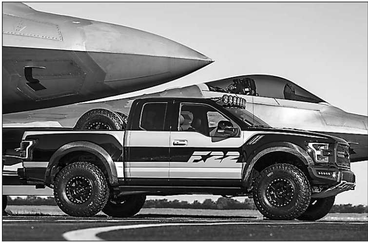
Ford's design for F-150 Raptor was inspired by the F-22 fighter jet.

F-150 Raptor is the ultimate high-performance off-road truck – the toughest, smartest, most