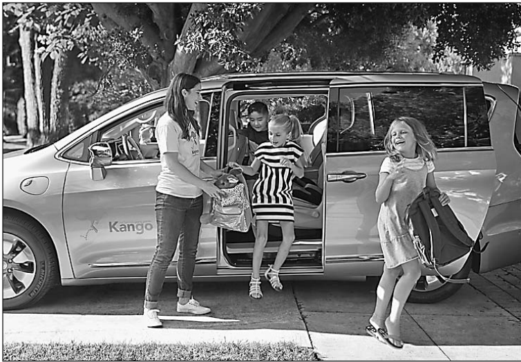
The Pacifica is the preferred minivan used by app provider Kango.

"Together with Kango, we will make it easier for parents to manage conflicting priorities at