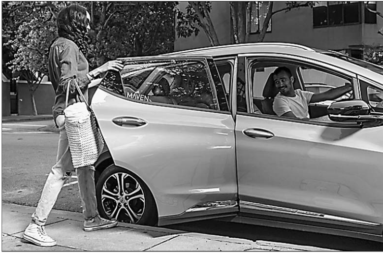
Maven Gig offers cars for freelancers to earn money the way they want.