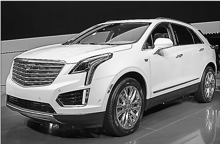
2017 Cadillac XT5

industries and organizations because of his involvement in IN-COSE, NDIA and other organizations. “He can give them a feel for what the entire industry looks like and how they compare to others taking on similar challenges. “With his experience and knowledge of how systems engineering has been applied at other companies, he can bring that. That’s how he makes such an impact at our students’ companies so quickly.”