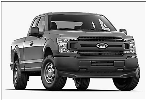
2018 Ford F-150