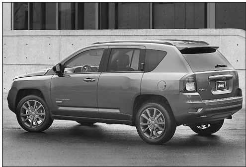
2017 Jeep Compass