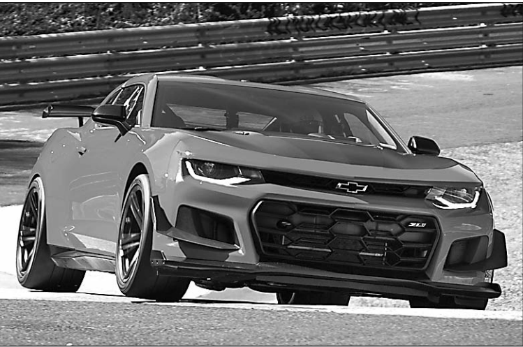
The Camaro ZL1 1LE set a record at the Nurburgring track in Germany.