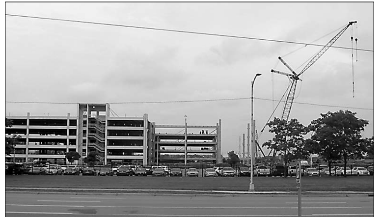
Once completed, this parking garage will have room for 2,400 vehicles.

"It's funny when we were talking with people about what they wanted done in the Tech Center to improve things, many people specifically mentioned that they'd like to see 12 Mile fixed up. We don't control 12 Mile, but when we heard it was going to be repaired, we worked with the government to minimize the impact."