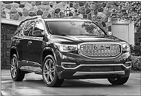
2017 GMC Acadia

For more information, contact Ball, U.S. Army public affairs office, at 586-282-7573.