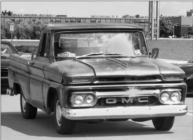
Designers hold an annual parade before the Woodward Dream Cruise.