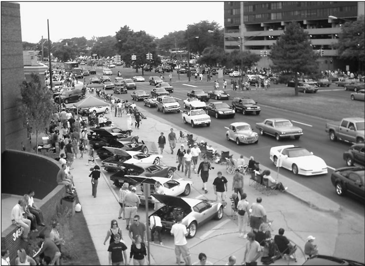
The Woodward Dream Cruise is celebrated by thousands.