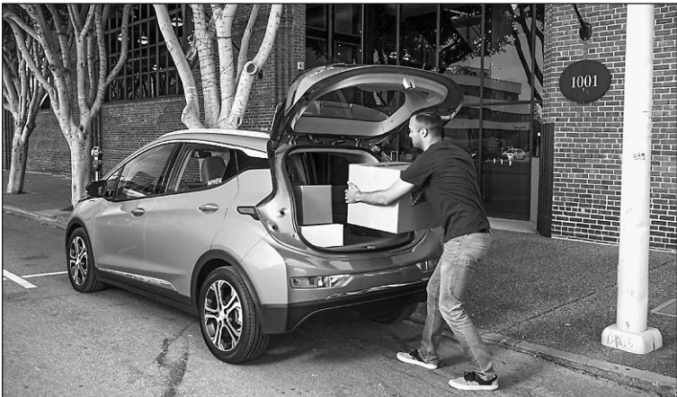
San Francisco residents can now use Maven's Chevrolet cars.

Additional vehicles, including the Chevrolet Cruze ($189 per week plus taxes), Malibu ($199 per week plus taxes) and Trax ($209 per week plus taxes), can be reserved in San Francisco. Maven continues to experiment and will adjust offerings based