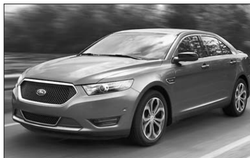
2017 Ford Taurus