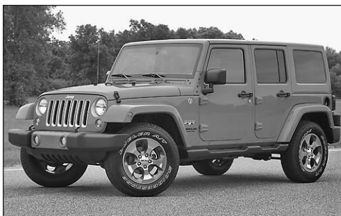
2017 Jeep Wrangler