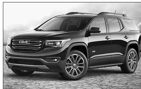
2017 GMC Acadia