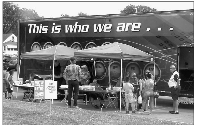
Kids got to enjoy the features of FCA's traveling training academy.