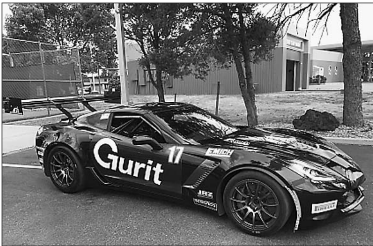
Rotek Racing's 2017 C7 Corvette Z06

the perfect event to demonstrate how our specially developed engine and parts add horsepower and overall performance in an extremely tough, competitive environment."