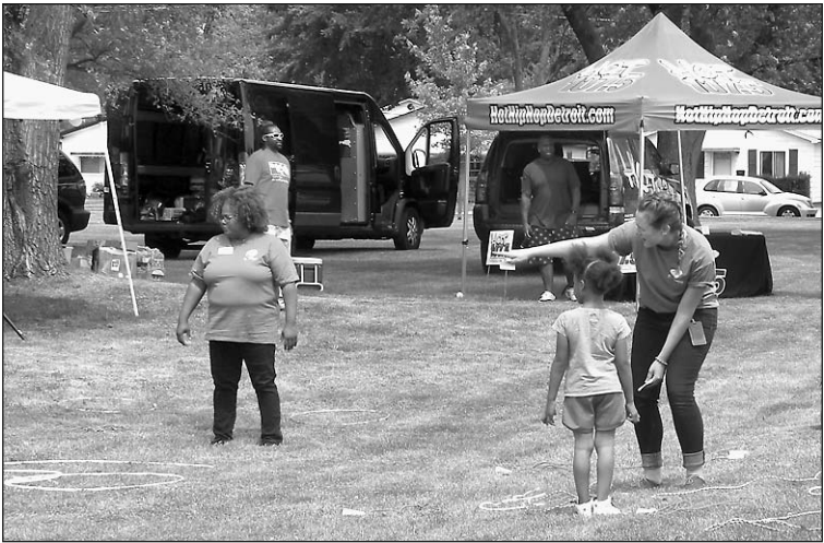
The FCA "Meet Up & Eat Up" event also featured games for children.