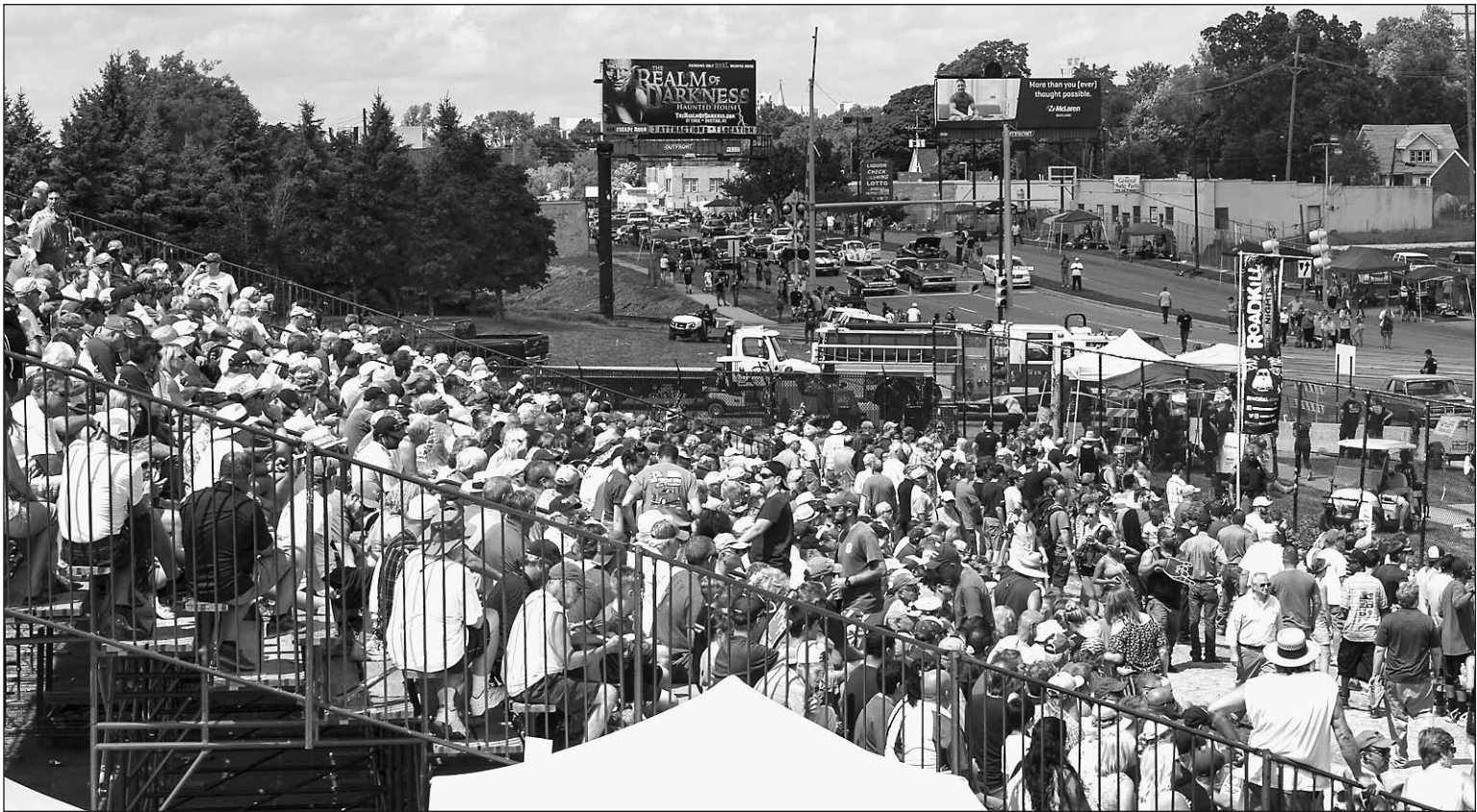
Street racing on Woodward proved so popular last year during the Woodward Dream Cruise that Chrysler is bringing it back again for 2017.

Additional activities include cacklefest, wheelstander exhibition runs, dyno tests, show 'n' shine, "Roadkill" toasts and exhibitions, Wunderlich said. New family-friendly activities this year include thrill rides on the M1