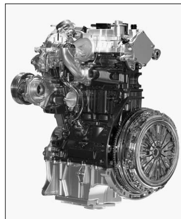
Ford 1.0-liter EcoBoost

"Even with 10 International Engine of the Year awards under our belt, we're still finding ways to push back the boundaries of powertrain engineering, and deliver even more benefit to our