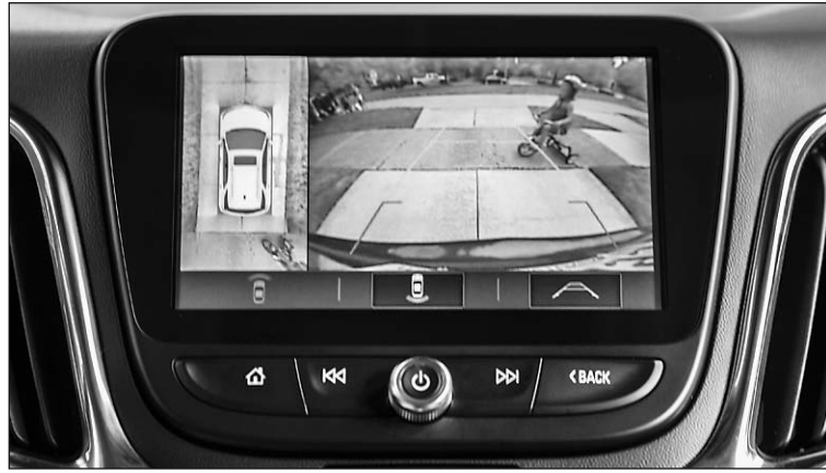
Chevy's Surround Vision provides a 360-degree bird's-eye view.

Before getting in a vehicle, all drivers, even those without chil-