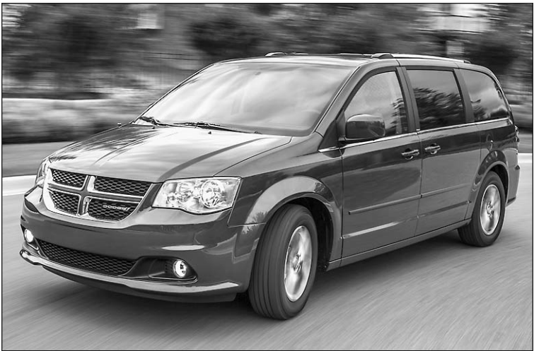
2017 Dodge Grand Caravan