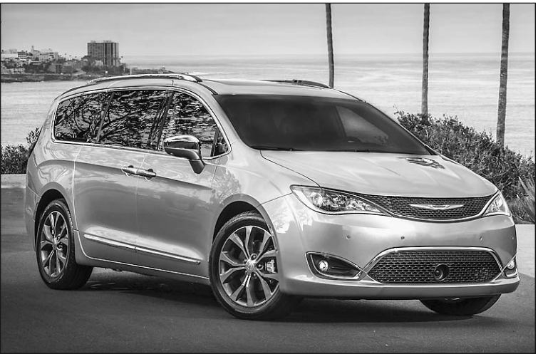
The 2017 Pacifica took top honors in the Minivan category.