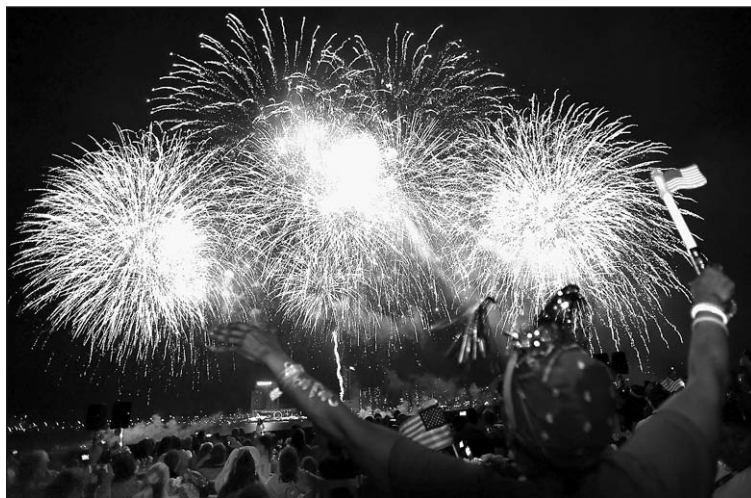
The Ford Fireworks Show is returning to the city of Detroit this year.