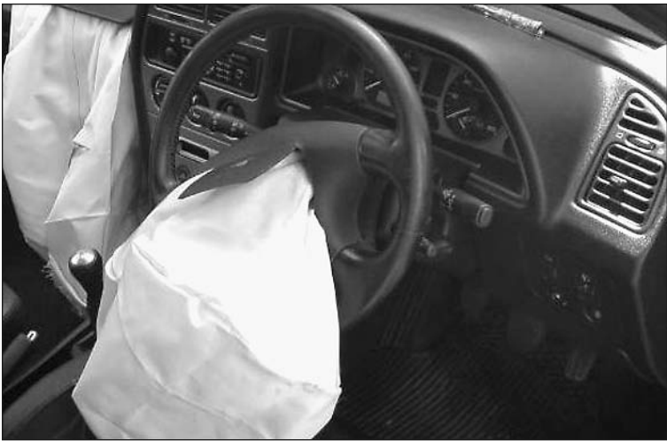
Deployed Takata airbags have resulted in deaths, financial troubles.