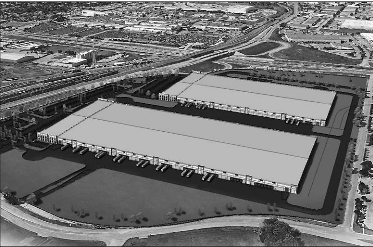
A rendering of the upcoming supplier park at GM's Arlington plant.