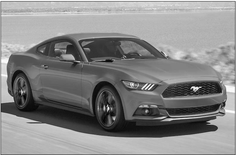
The 2017 Mustang earned high marks from consumers for initial quality.