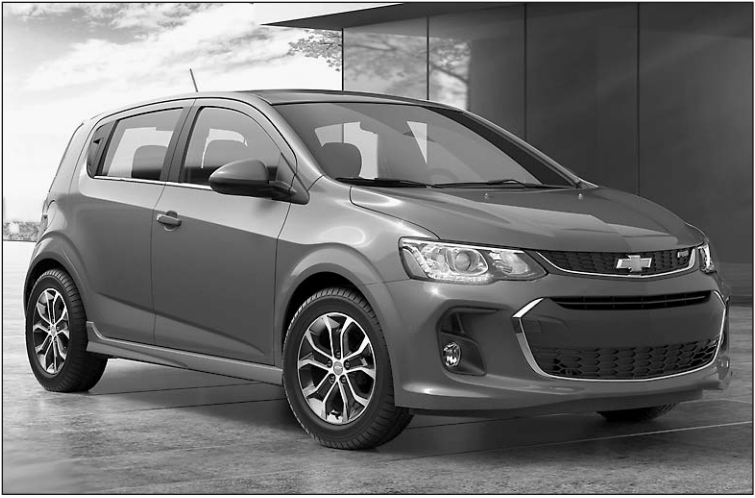
Consumers picked 2017 Sonic as best small car in J.D. Power study.