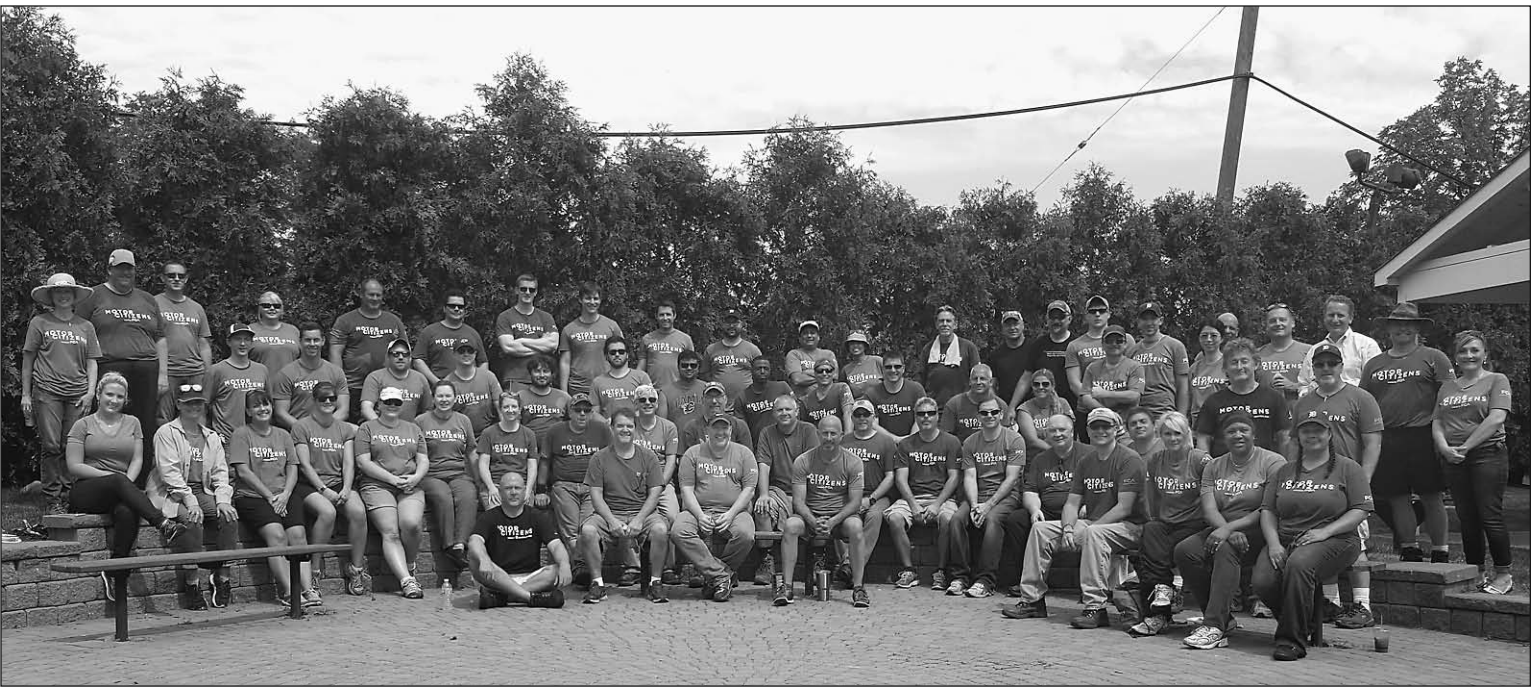
CONTINUED ON PAGE 4 60 volunteers from Fiat Chrysler's Global Architecture and Standardization - NAFTA Concept and Innovation helped Grace Centers improve lives.