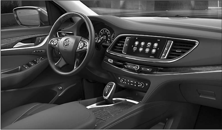
The 2018 Buick Enclave Avenir interior

chrome wings inspired by Buick concept cars. Additional Enclave Avenir notable styling cues include 20-inch, six-spoke wheels with a pearl nickel finish; five premium exterior colors; an Avenir Chestnut and Ebony interior with piping on the seats and contrasting stitching; embroidered first-row headrests; Avenir floor-mats; a wood-accented steering wheel; and bold Avenir-scripted sill plates on all four doors. A wide array of advanced