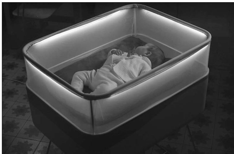
This Max Motor device is the stuff dreams are made of – literally.