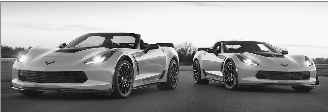
To celebrate 65 years of Corvettes, 650 limited edition Carbon 65 Corvettes will be produced by GM.