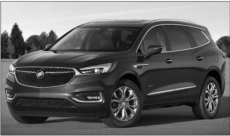
2018 Buick Enclave Avenir