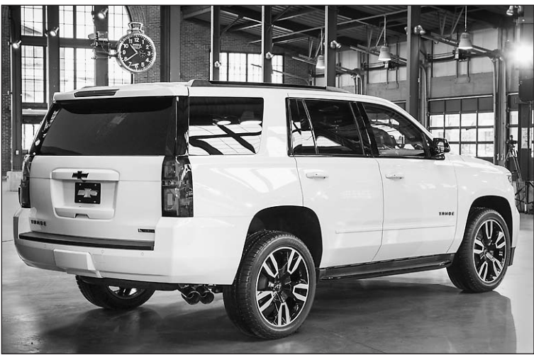
The 2018 Chevrolet Tahoe RST

Based on preliminary estimates, the Tahoe RST Performance Package will offer a towing capacity of 8,400 pounds and the truck will be cable of 0-60