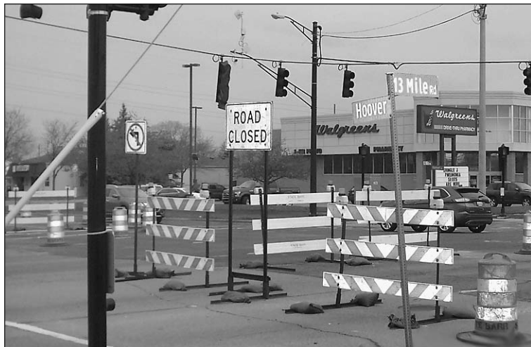
Drivers around the Tech Center will see a lot more of this in 2017.