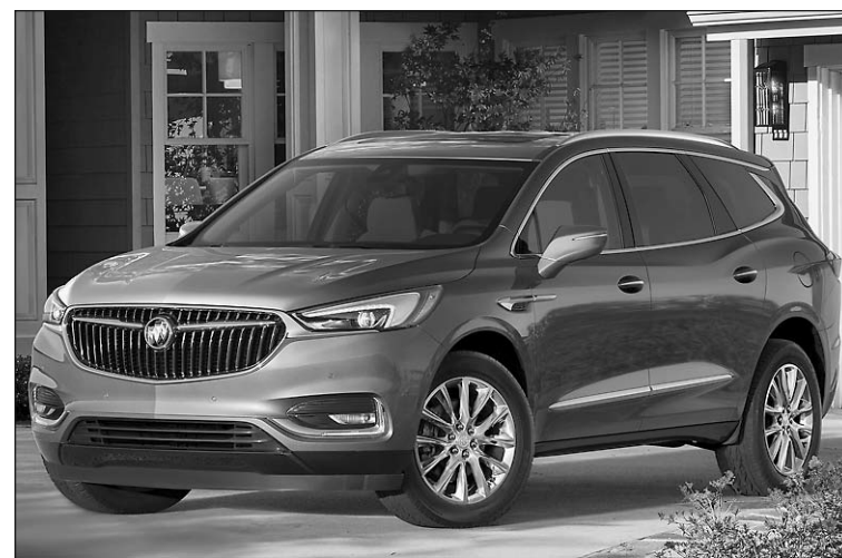
2018 Buick Enclave

The new Enclave also features a longer wheelbase than the previous generation, yet its turning circle is 1.4 feet tighter than before, pairing the space cus-