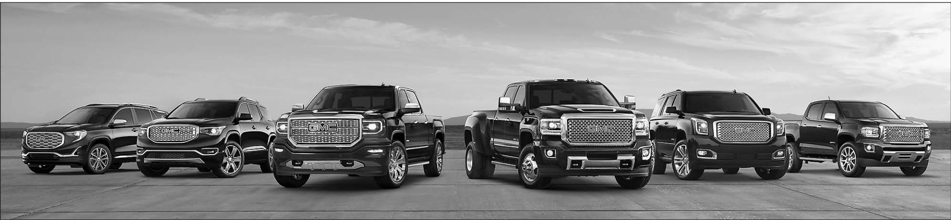
Consumers have shown their approval – for the fourth year in a row – of the GMC brand’s lineup of SUVs and pickup trucks, winning Kelley Blue Book’s Brand Image Award.