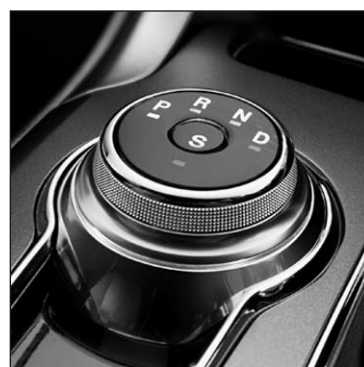
The new Ford shifter