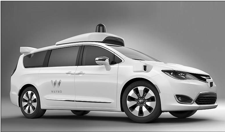
One of 100 test vehicles built by Fiat Chrysler for Silicon Valley's Waymo.