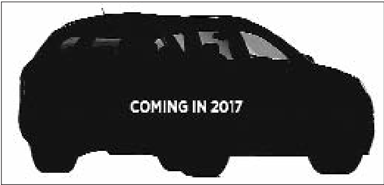
The 2018 Traverse will be unveiled at the 2017 NAIAS at Cobo Center.

to 8,300 pounds of trailering capacity when properly equipped, and up to 121.7 cubic feet of cargo space.