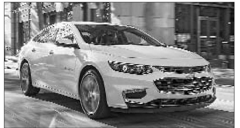
2016 Chevrolet Malibu