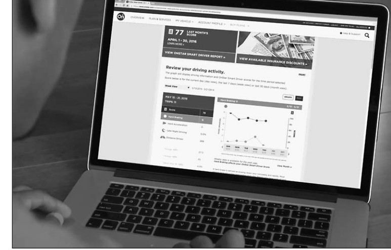
CONTINUED ON PAGE 2 Buick allows owners to check their driving habits with their devices.