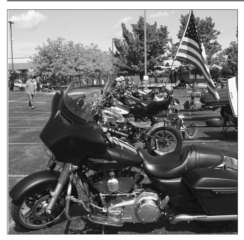
Motorcycles were on display for the first time at the Region 1 car show.