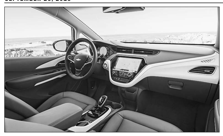
2017 Bolt EV's interior