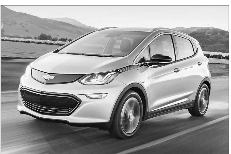
New 2017 Chevrolet Bolt