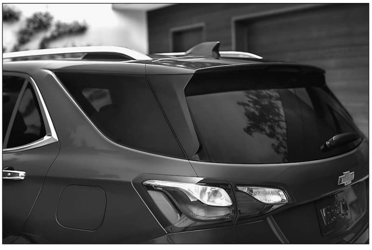
Equinox's horizontal taillamps 'emphasize wide stance' - GM's Batey

"And it looks great doing it." Additional vehicle highlights include being about 400 pounds lighter than the current model a 10 percent weight reduction, Kuhnen said.