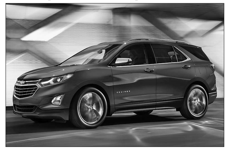
2018 Chevrolet Equinox

It is a richer, more detailed design featuring chrome trim on all to the interior, making the