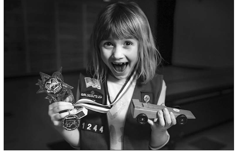
Ford is inviting Girl Scouts to participate in track car racing.