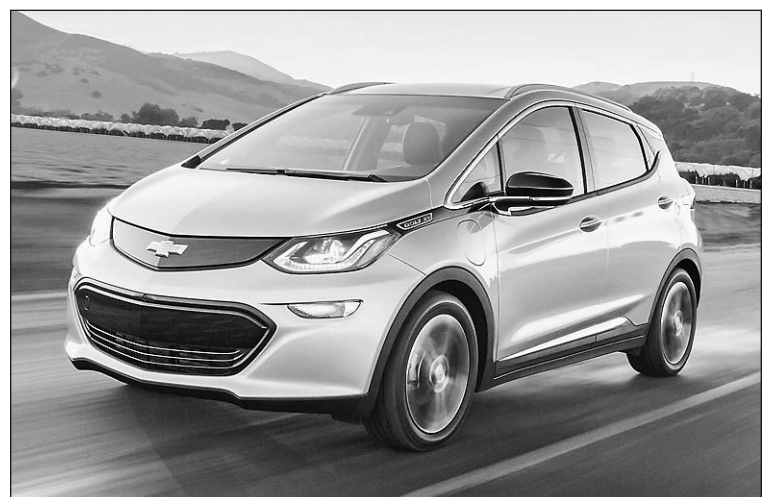
2017 Chevrolet Bolt EV