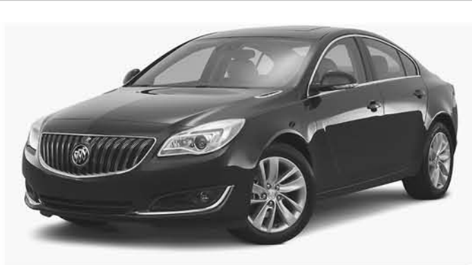
2016 Buick Regal Premium II

RAY LAETHEM'S GM Employee Lease $59 */24 MO