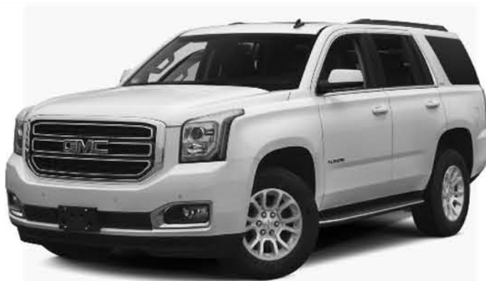
2016 GMC Yukon SLE

RAY LAETHEM'S GM Employee Lease $129 */24 MO