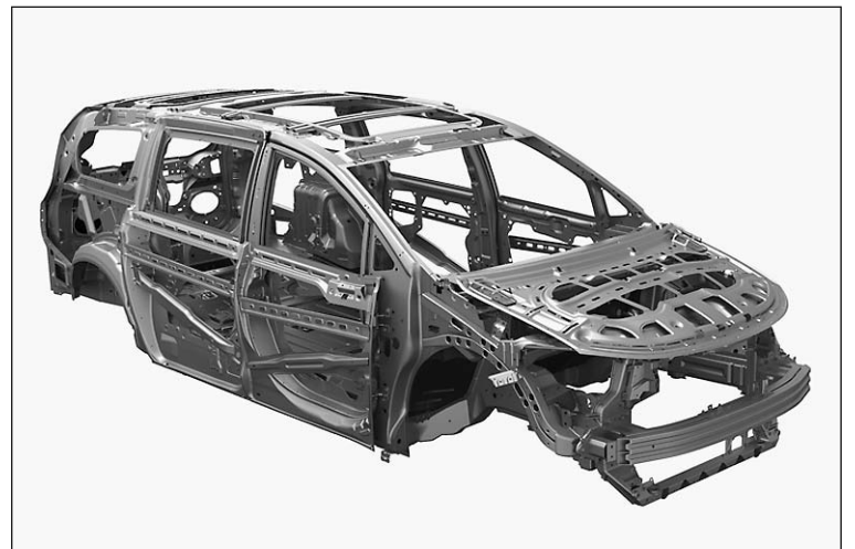
High-strength steel is major contributor to Pacifica's crashworthiness.