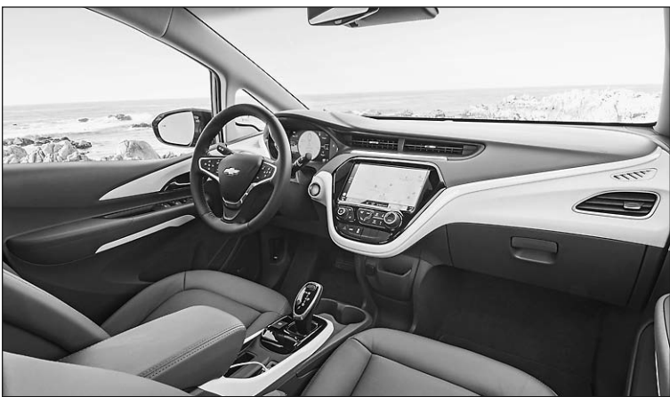
2017 Bolt EV's interior