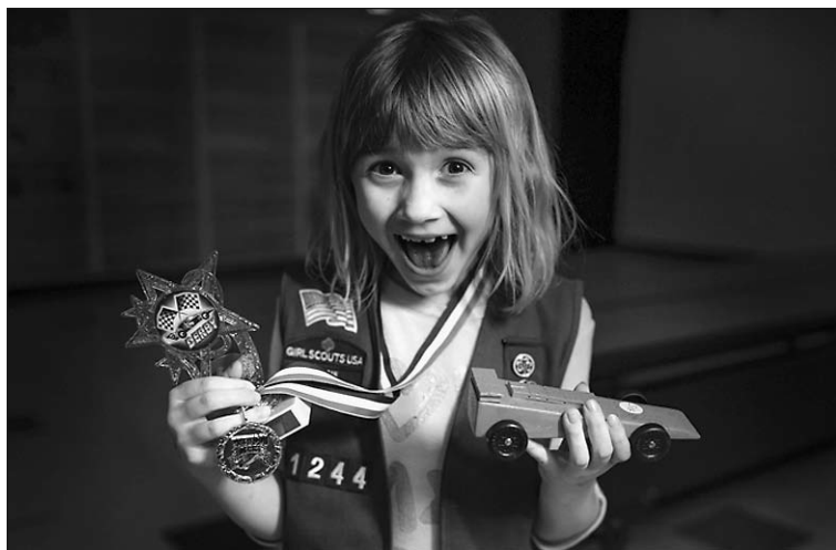
Ford is inviting Girl Scouts to participate in track car racing.