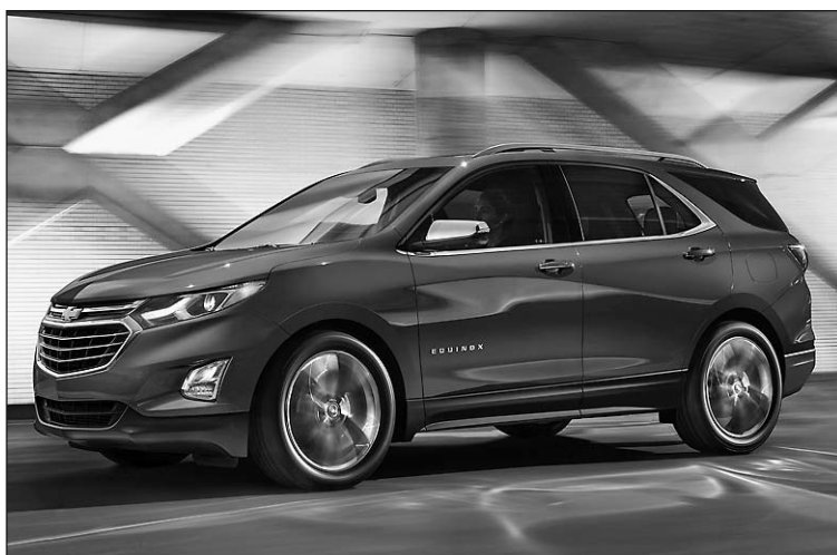
2018 Chevrolet Equinox