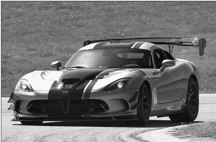
2016 Dodge Viper ACR

The full analysis of all of the chosen vehicles is featured in the October issue of Car and Driver , on newsstands and available for sale right now. It is also available online at CarandDriver.com.