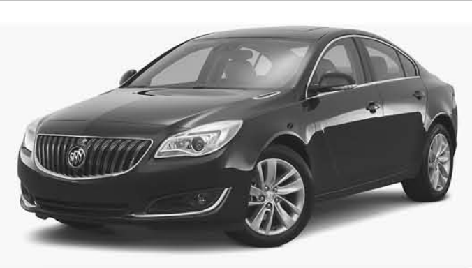
2016 Buick Regal Premium II

RAY LAETHEM'S GM Employee Lease $59 */24 MO