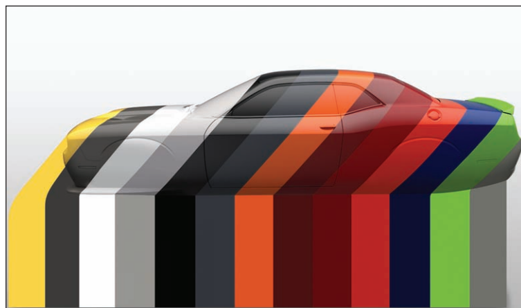
Dodge sparks up color names by reaching into its heritage.

"The average daily driving habits of 80 percent of American drivers is 40 miles," Ligouri said. "In the Bolt EV, our engineers have developed a vehicle that has a range that allows drivers to go from home to work to errands. They can pick up their kids at school without having to fear their vehicles will run out of power. They can drive the Bolt EV with full confidence."