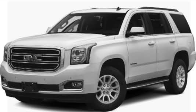
2016 GMC Yukon SLE

RAY LAETHEM'S GM Employee Lease $129 */24 MO