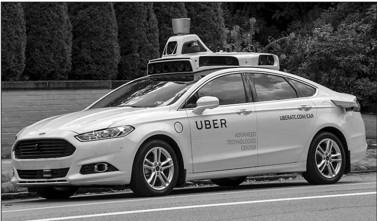
An Uber autonomous car being tested in Pittsburgh.

The Uber vehicles are equipped with everything from seven traffic-light detecting cameras to a radar system that detects different weather conditions to 20 spinning lasers that