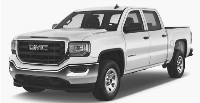
2016 GMC Sierra 4WD Double Cab SLE