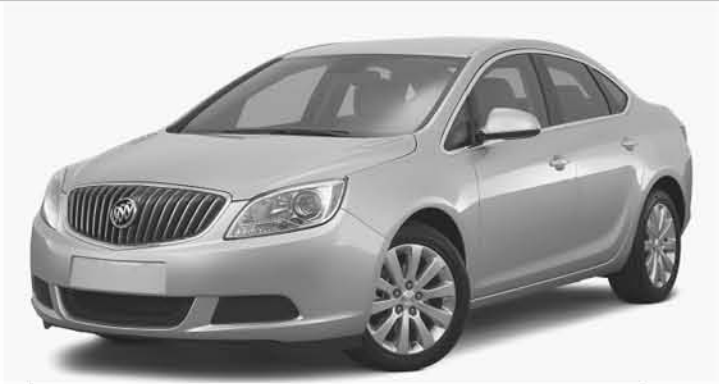
2016 Buick Verano Sport Touring

Lowest lease prices on like-new 2016 Buick Regal and Verano demos (Over 70 like-new CTP vehicles to choose from. Call 313 881-6700 for availability.)