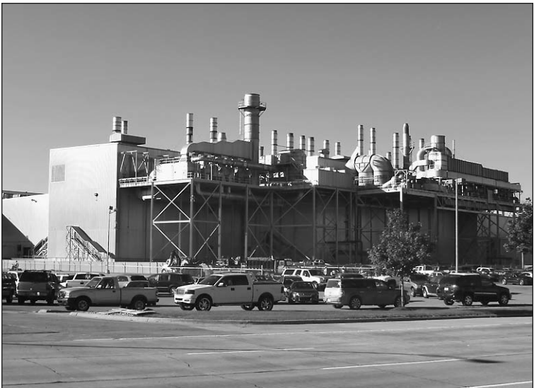
The Ford Michigan Assembly plant will be retooled for a new vehicle.