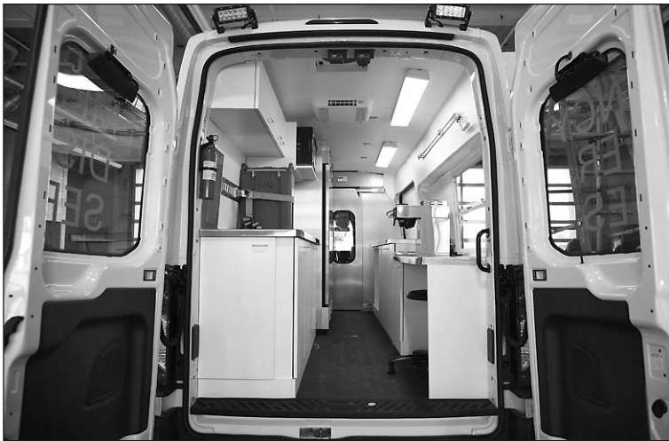
The Transit van will be modified by nonprofits for disaster relief.

responders can take our efforts to a higher level and help more people.”