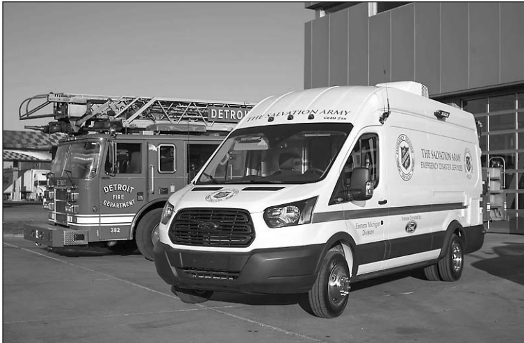
Ford is presenting three grants to buy Transits for emergency vehicles.

“Ford’s strength as a mobility company combined with the know-how of dedicated disaster