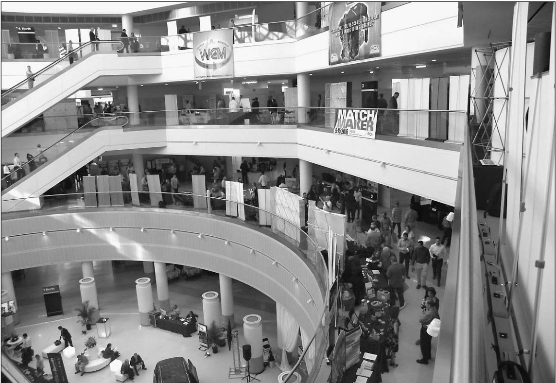
About 3,000 suppliers from 280 businesses gathered to connect with each other at FCA event Sept. 15.