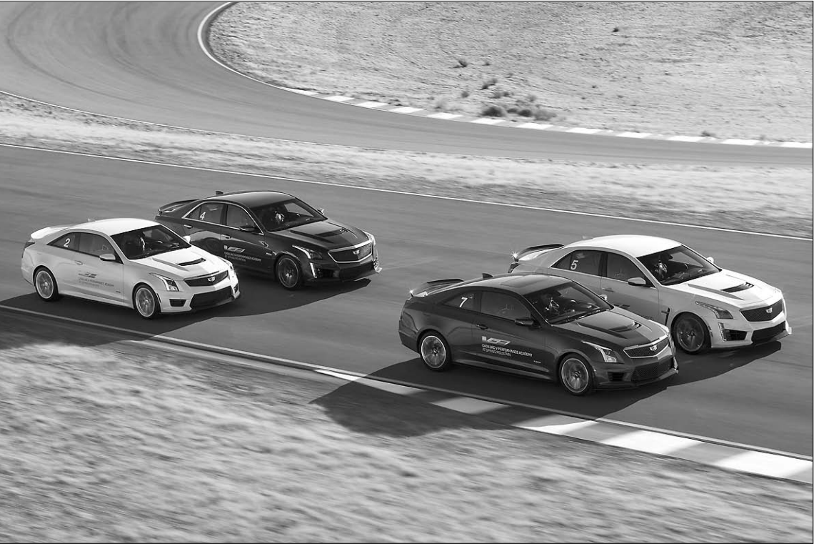
The Cadillac V-Performance Academy driving experience at Spring Mountain Motor Resort and Country Club.