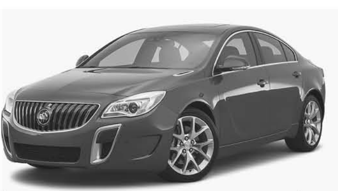
2015 Buick Regal GS