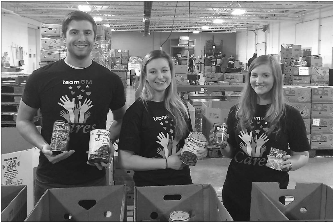
GM TRACK employees packed food boxes at Food Bank of Eastern Michigan in Flint earlier this year.