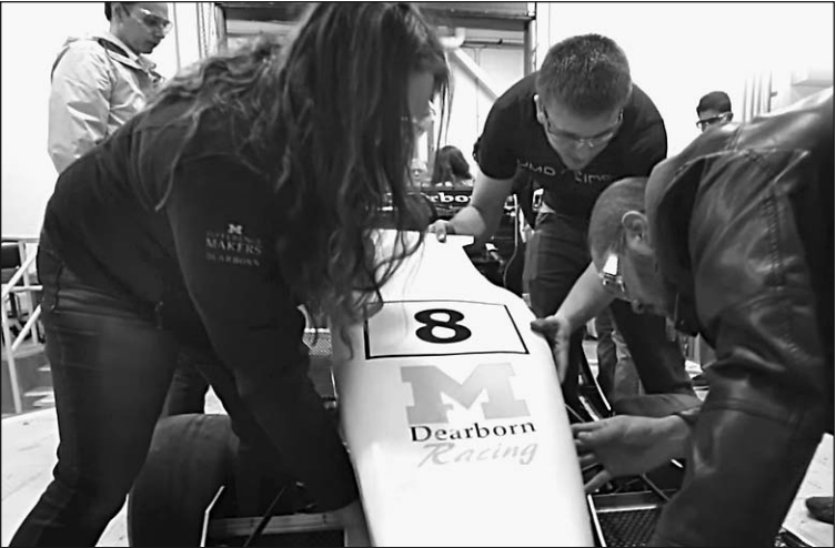
University of Michigan-Dearborn students at work on a race car.