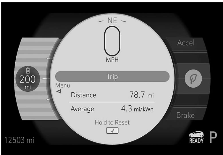
A screen in the instrument cluster of the 2017 Chevrolet Bolt EV.

Registration is required. Register at www.warrenlibrary.net or call 586-751-5377.