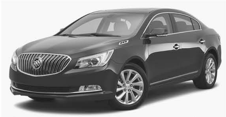
2015 Buick LaCrosse