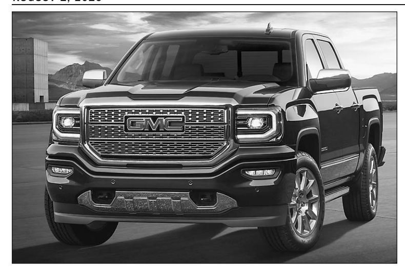
A recent AutoPacific study rated the 2016 GMC Denali highly.