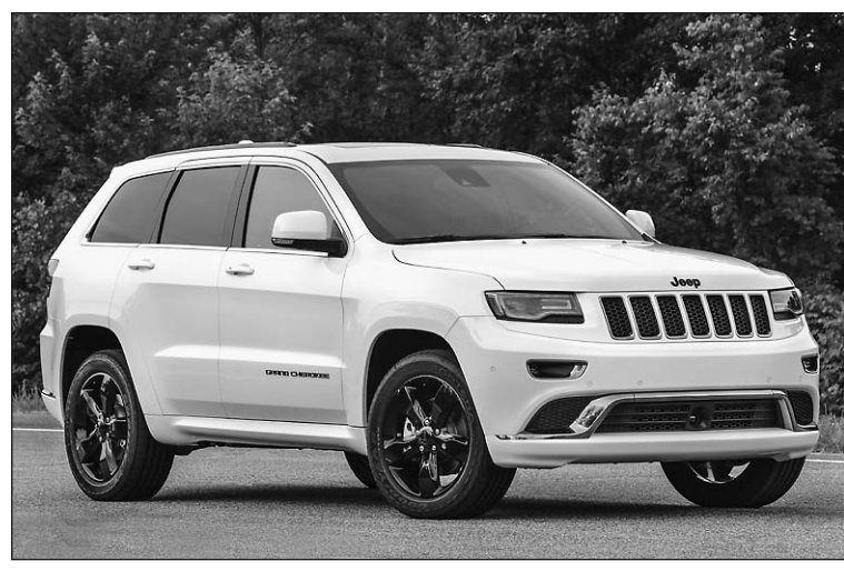
Consumers like the 2016 Jeep Grand Cherokee according to J.D. Power.

vice president of quality. "We realize that every touch point, whether it is the vehicle's appeal, initial quality or long-term durability, impacts our ability to earn customers for life.'