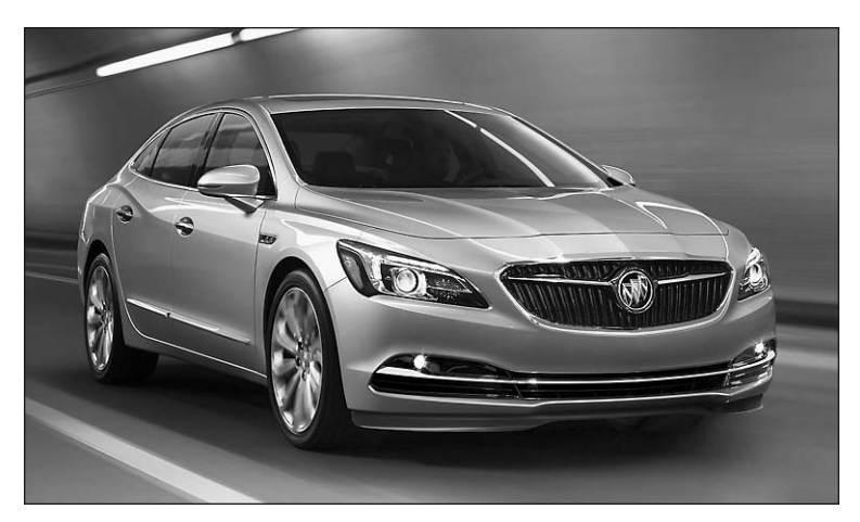
The new 2017 LaCrosse is Buick's design and technology flagship.

"FIRST IN THE HEART OF DETROIT SINCE 1933" AUGUST 1, 2016 PAGE 3