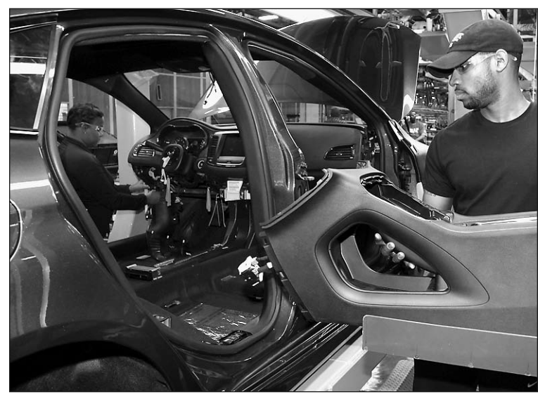
SHAP is switching from the Chrysler 200 to the Ram 1500.