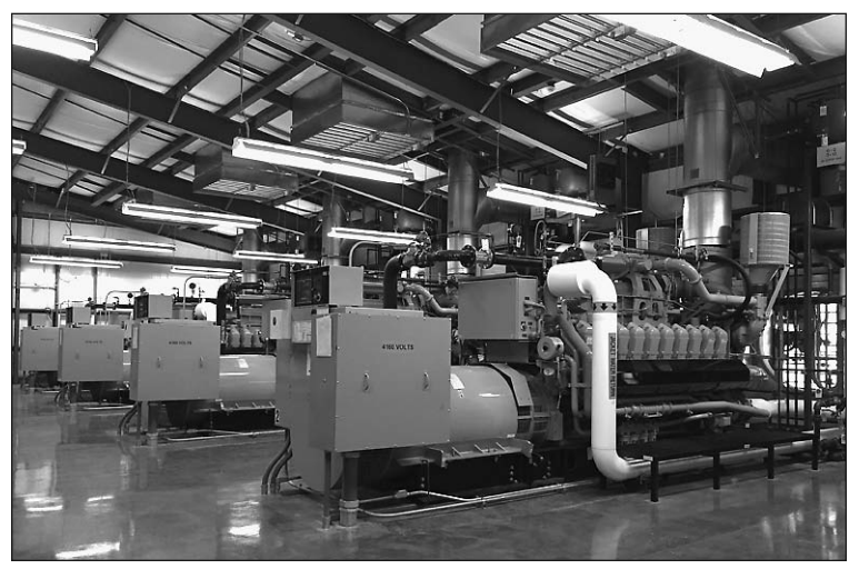
Orion Assembly is powered by locally-generated methane gas.