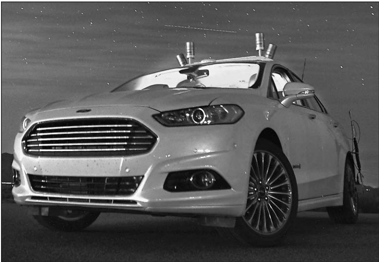
Ford tests Fusion Hybrid autonomous research vehicles at night.

Researchers say other automakers' electric cars haven't caught on because their range is limited to around 100 miles. And even General Motors' Chevrolet Bolt, which will go more than 200 miles per charge and is priced similarly to the Model 3, won't attract a frenzy of buyers because