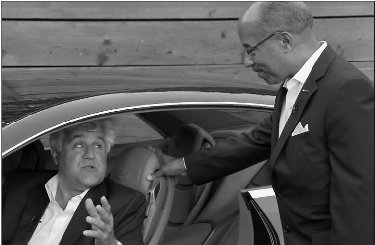
Leno and Welburn talk cars. "He can't turn it off," Leno said.

"Ed's doing it right," Leno said. "He's leaving GM in a very strong