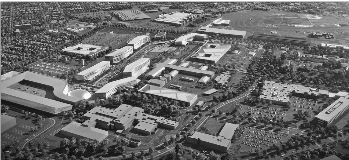
Rendering of the future Ford Research and Engineering Center

The campus also will serve as a pilot location for Ford Smart Mobility solutions, Fields said, including autonomous vehicles, on-demand shuttles and eBikes to transport employees.