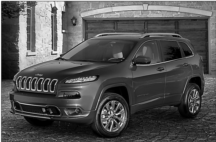
Jeep will debut its 2016 Jeep Cherokee Overland model in Geneva.

"As a global brand, the models that you'll see in Europe are very similar to the ones you see in