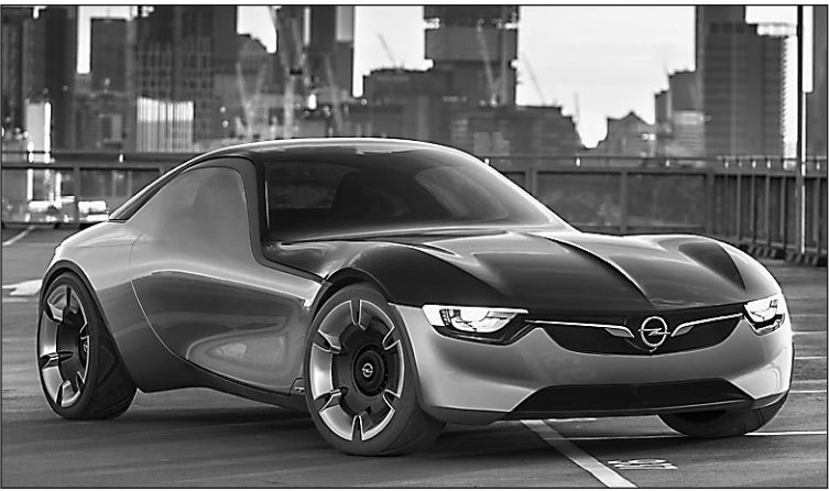
Opel is showing off its GT concept car at the Geneva Auto Show.

important as the exterior. The instrument panel of the GT Concept made from brushed aluminum visually enhances the lightweight construction (the overall weight remains below 1,000 kg) and seems to float in front of the occupants.