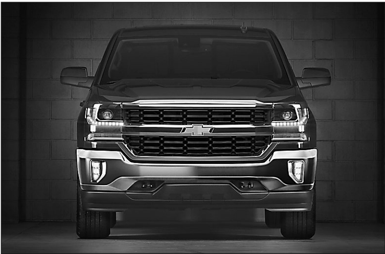
2016 Chevy Silverado

Compared with a comparable Sierra 1500 with a 5.3L/eight-speed powertrain, the Sierra with eAssist offers an EPA-estimated 18 mpg city – a 2-mpg improvement – while highway fuel economy improves 2 mpg to 24 mpg. The combined estimate improves 2 mpg to 20 mpg. The 5.3L eAssist V8 has a GM-estimated 355 hp and 383 lb.-ft. of torque,