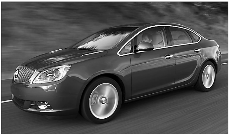
The 2013 Buick Verano has proven to be very dependable.