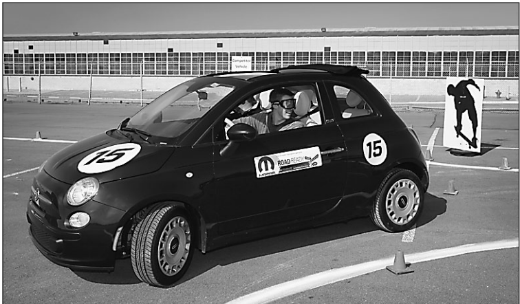
Students learn driving techniques at ‘Mopar Road Ready.’