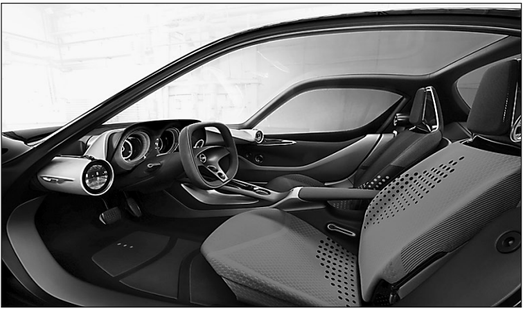
The Opel GT concept car's interior will display futuristic designs.

The sports car is operated purely by voice control and a central touchpad. Experts refer