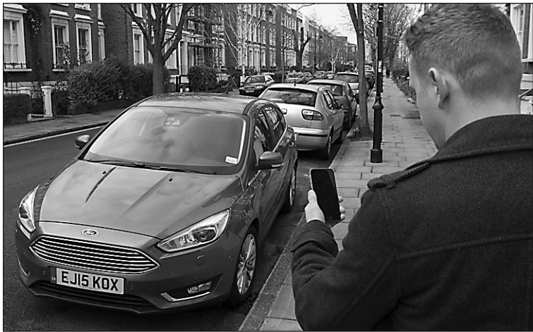
Ford's new GoPark system at work in London.