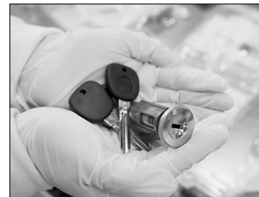
GM fixed ignition assembly parts

Despite the settlements, GM still faces costs from the recalls. In its most recent quarterly report filed with U.S. regulators the