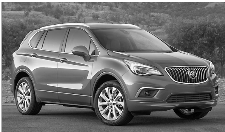
2016 Buick Envision