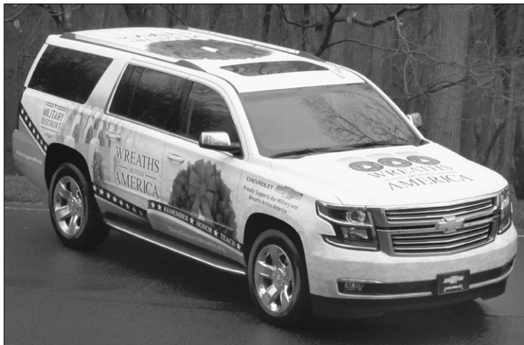
Chevy honors veterans by supporting wreath program.

Wreaths Across America began when Maine businessman Morrill Worcester – inspired by the power of Arlington National Cemetery during a childhood visit – began placing wreaths there in