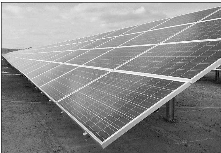
GM is adding solar power to its Bowling Green assembly plant.