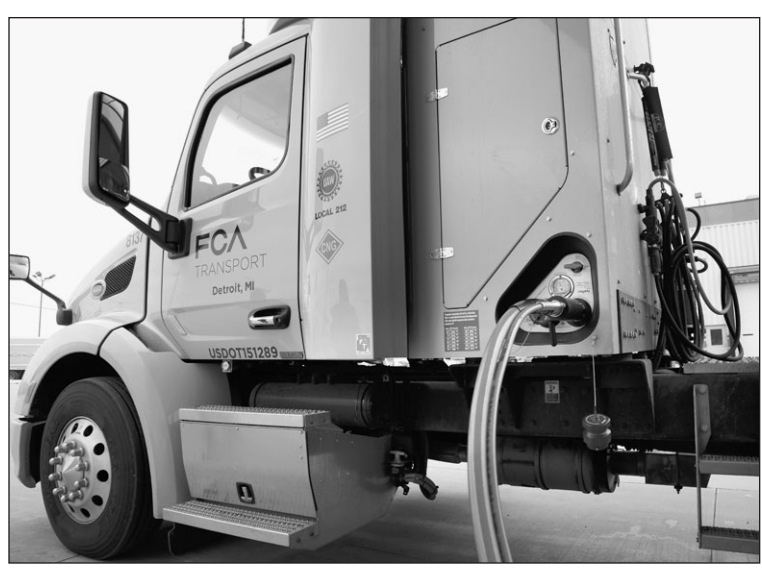
One of Fiat Chrysler's new CNG trucks being fueled.

Prior to the changeover, the FCA Transport Detroit fleet used nearly 2.6 million gallons of diesel fuel per year while driving about 16 million miles to deliver parts to assembly plants from suppliers and Fiat Chrysler component facilities.