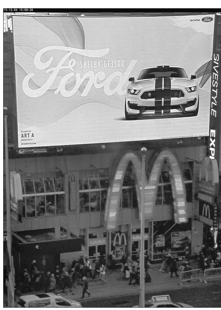
{\it Consumer-made\ images\ will\ grace\ Ford\ bill boards\ across\ the\ country.}