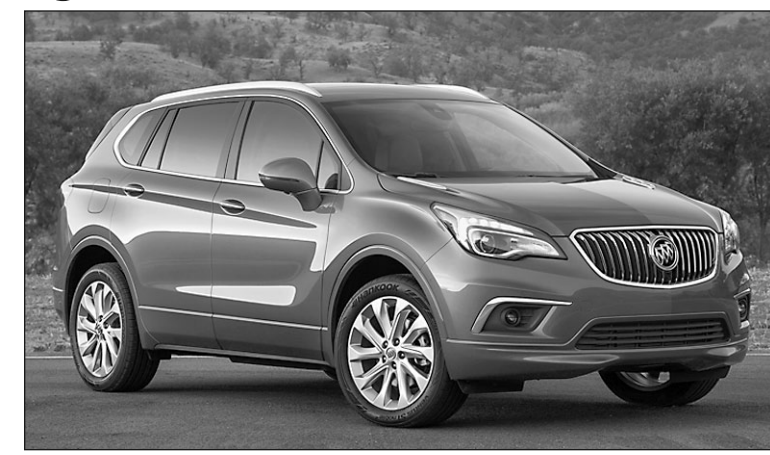
2016 Buick Envision