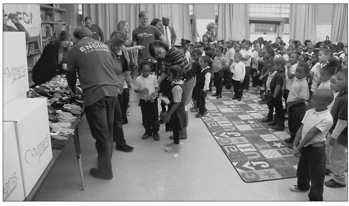
Dossin Elementary students in Detroit get warm mittens for the winter.