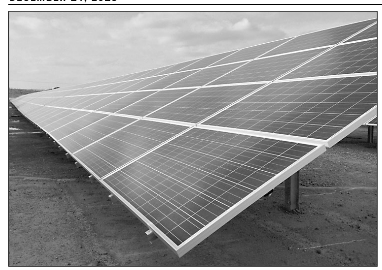
GM is adding solar power to its Bowling Green assembly plant.