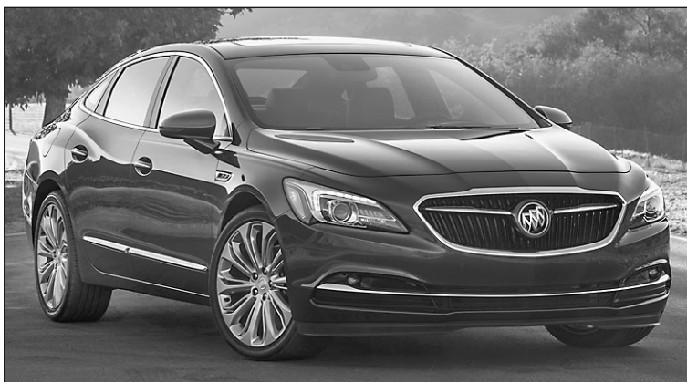
2017 Buick LaCrosse