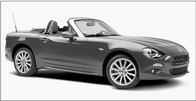
The Fiat 124 Spider was unveiled recently at the Los Angeles Auto Show.

Features like the hexagonal upper grille and grille pattern, "power domes" on the front hood and sharp horizontal rear lamps call to mind details of the