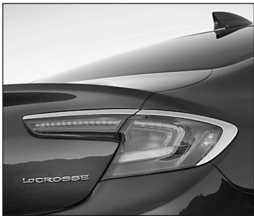
Rear view of the 2017 LaCrosse.

matched by wheels pushed outward 1.3 inches in the front and 1.1 inches in the rear, while the car's width has grown only 0.4-inch, creating a wheels-at-corners stance intended to convey road confidence.