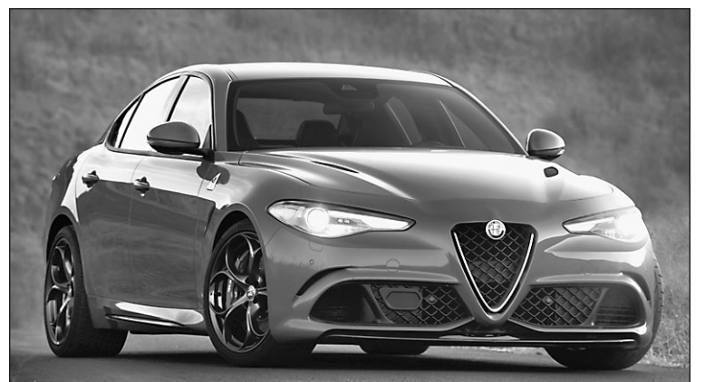
2017 Alfa Romeo Giulia Quadrifoglio