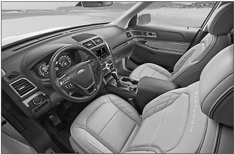
2016 Explorer is the latest to use the common seat architecture.

"Our seats are designed to hold people where they want to be held, but without being