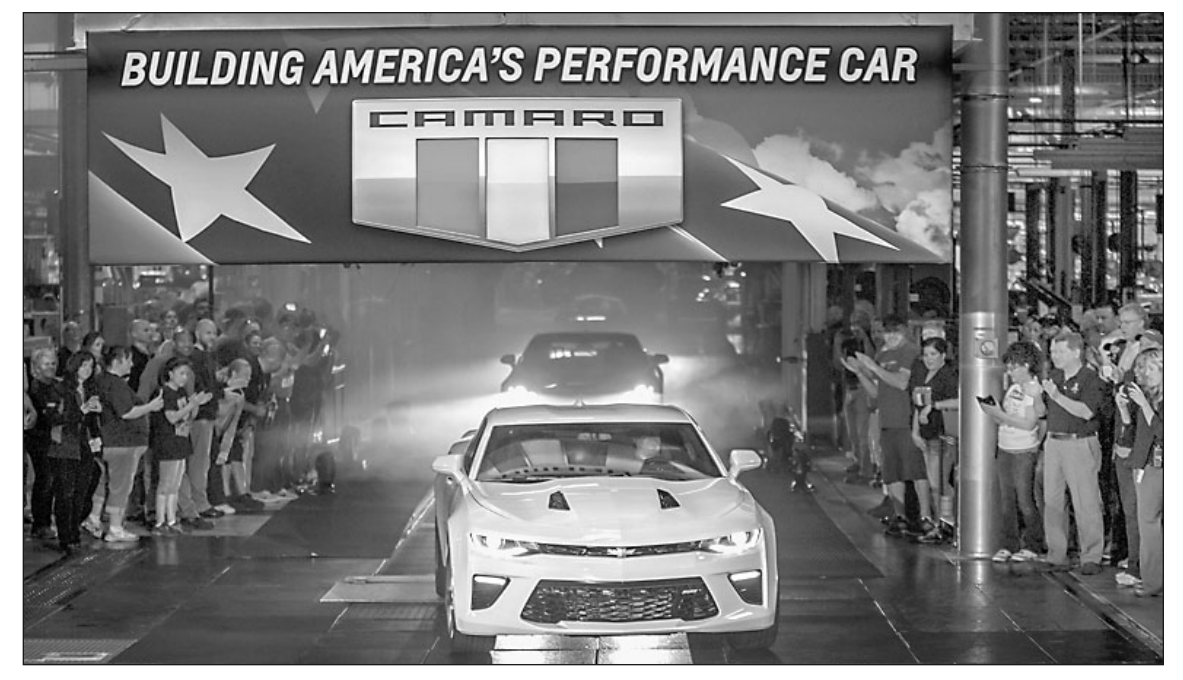
The first 2016 Camaro rolled off the Lansing Grand River assembly line on Oct. 26.

"We have received great products here because of the quality of work always performed by the Lansing autoworker, active and