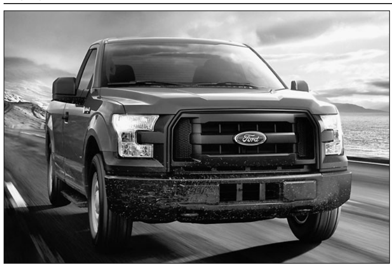
2015 Ford F-150