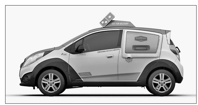
2015 Spark decked out as Domino's DXP (delivery expert) vehicle.