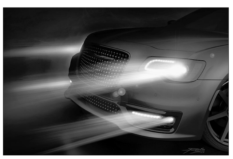
A taste of the Mopar-customized Chrysler 300 coming to SEMA.

He stood by his ambitious goal of increasing Alfa sales to 400,000 units by 2018, but said a portion of the volume goals for China would be shifted to other mar-