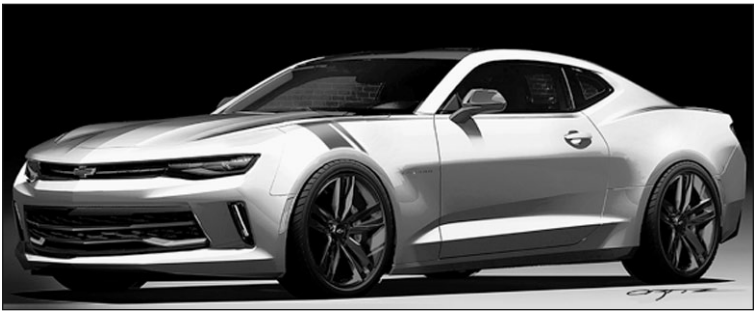
This 2016 Camaro was modified using Red Line Series concept parts.