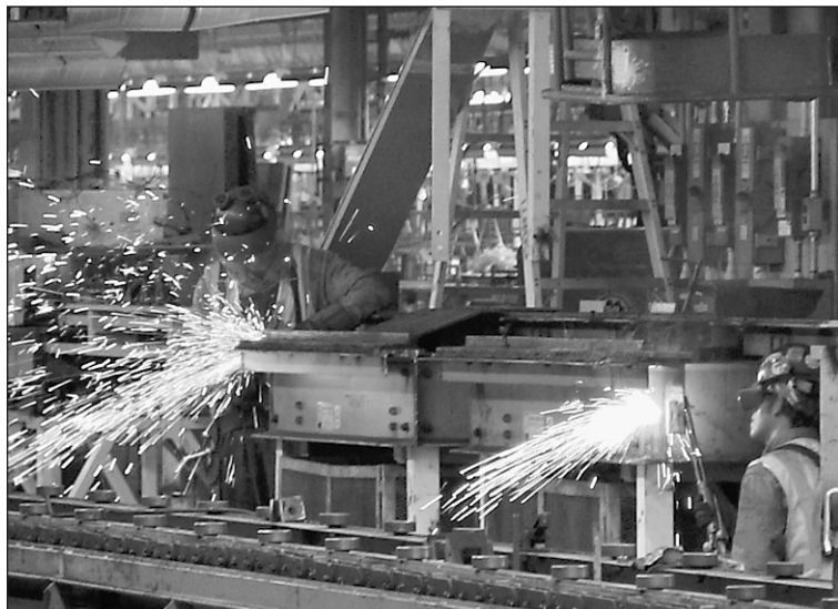
Workers at Detroit-Hamtramck will soon have 1,200 new colleagues.