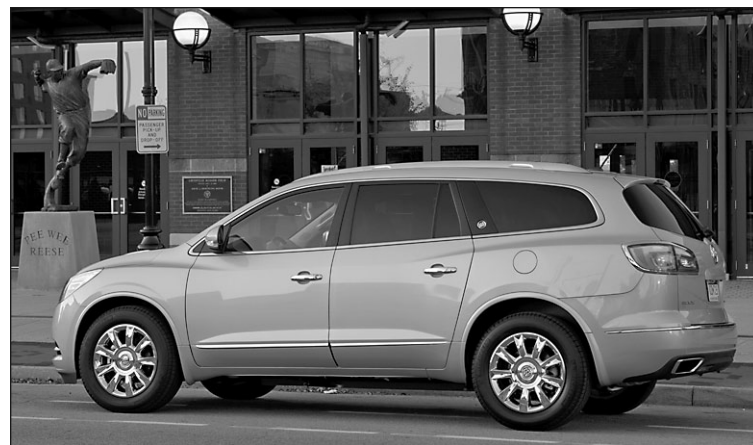
2015 Buick Enclave

He said that the vehicles that were rated as popular with Consumer Reports testers weren't nec-