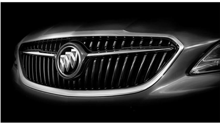
LaCrosse will debut in November at the Los Angeles Auto Show.