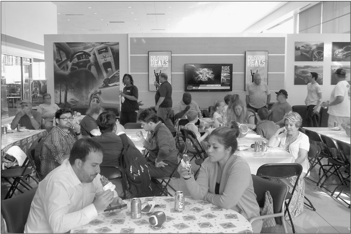
Customers enjoy coney island hot dogs at the new waiting area at Ed Rinke Chevrolet Buick GMC.