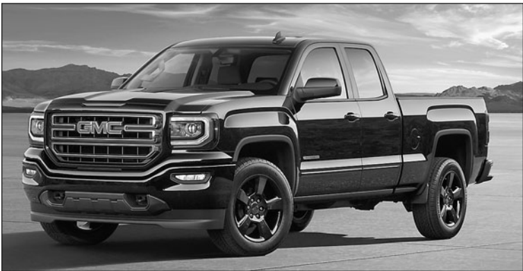
2016 GMC Sierra

Inside Sierra Elevation Edition, the latest technology helps drivers stay connected at all times. A new radio with a 7-inch-diagonal screen incorporates CarPlay and Android Auto phone integration capability, which gives drivers the ability to make calls, send and receive messages and control music from the IntelliLink touchscreen. Additionally, On-Star 4G LTE and a built-in Wi-Fi hotspot allow continuous connectivity for up to seven personal devices.