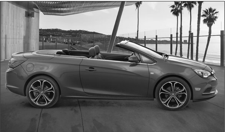
The price has been set for the upcoming 2016 Buick Cascada.

Americans got their first look at the Cascada at the 2015 North American International Auto Show. The vehicle will be available in the spring of 2016. It is based on the Opel Cascada, which was developed at GM’s International Technical Develop-