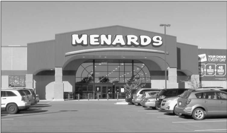
Menards New store on Vandyke in Warren has opened its doors.