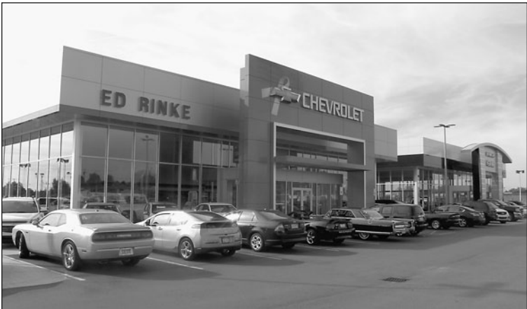
Ed Rinke Chevrolet Buick GMC has rebuilt its showroom building.