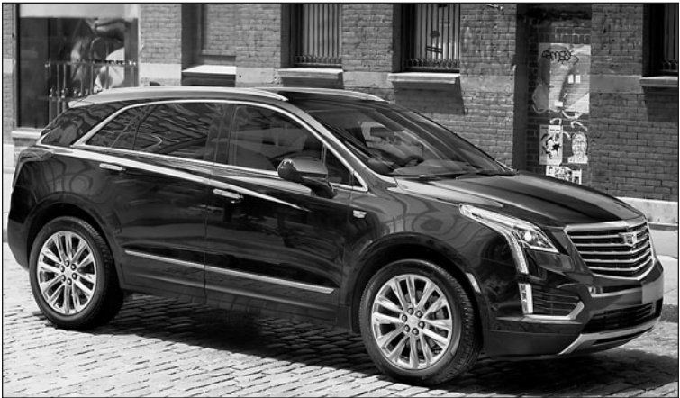
The 2017 Cadillac XT5 will debut at the Dubai Motor Show.