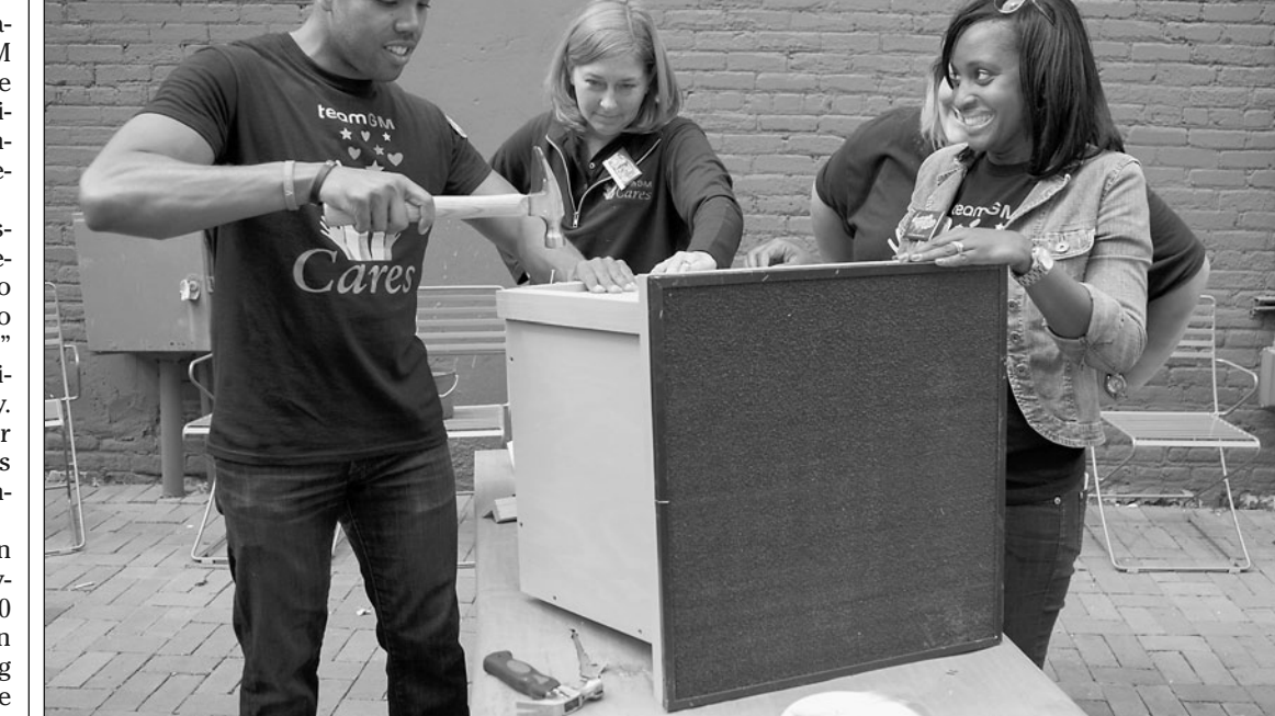
GM employees help build Little Free Libraries at New Center Park in Detroit,