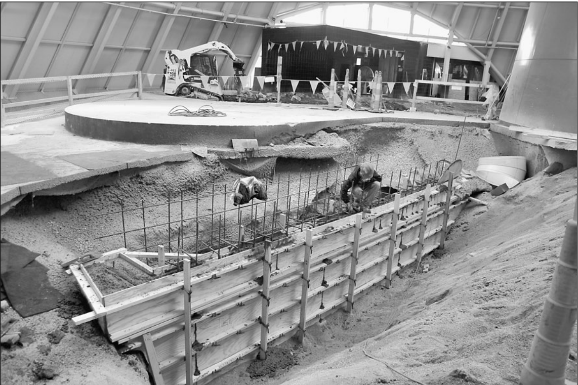
Work began immediately to fill the sink hole and repair the damage it caused at the Corvette museum.