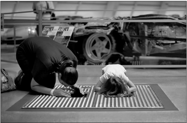
Tourist at the Corvette Museum look down where the sink hole was.