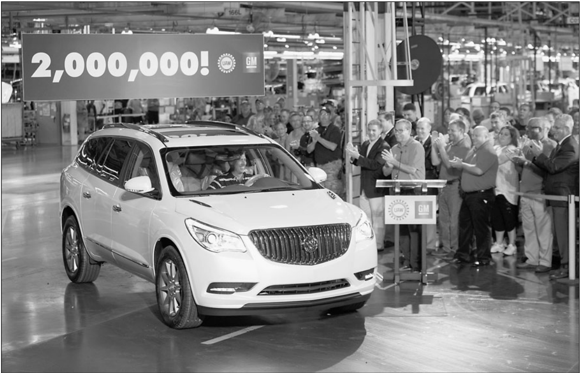
The 2 millionth vehicle rolls off the Lansing Delta line on Aug. 14.