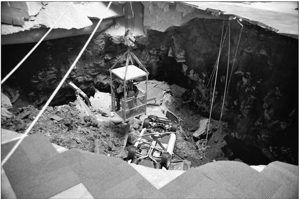
One of eight Corvettes damages when a sink hole opened up at the National Corvette Museum last year.

“It’s just horrifying,” said Corvette owner Doug Kidd, of Canton, Ohio. “Nature’s a pretty big thing to deal with. They look like they went through a tornado.” Seven of the eight cars are back on display in about the same spot where they plunged to fame. Five were too beaten up for repairs. One is fixed, another will return Sept. 3 after being repaired in Michigan and another will be restored by the museum. The eight cars carried a total value believed to exceed $1 million. The museum’s Facebook followers now exceed 200,000, compared to about 50,000 before the sinkhole opened. On social media, photos showcasing the damaged cars outpace those of the shiny, sleek models on display,