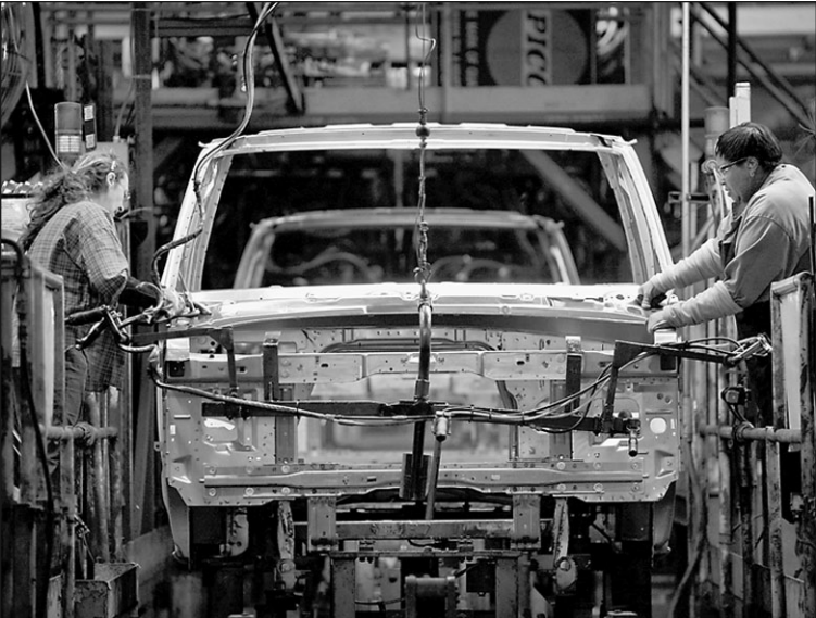
Workers at Ohio Assembly building new Ford F-650/F-750 trucks.