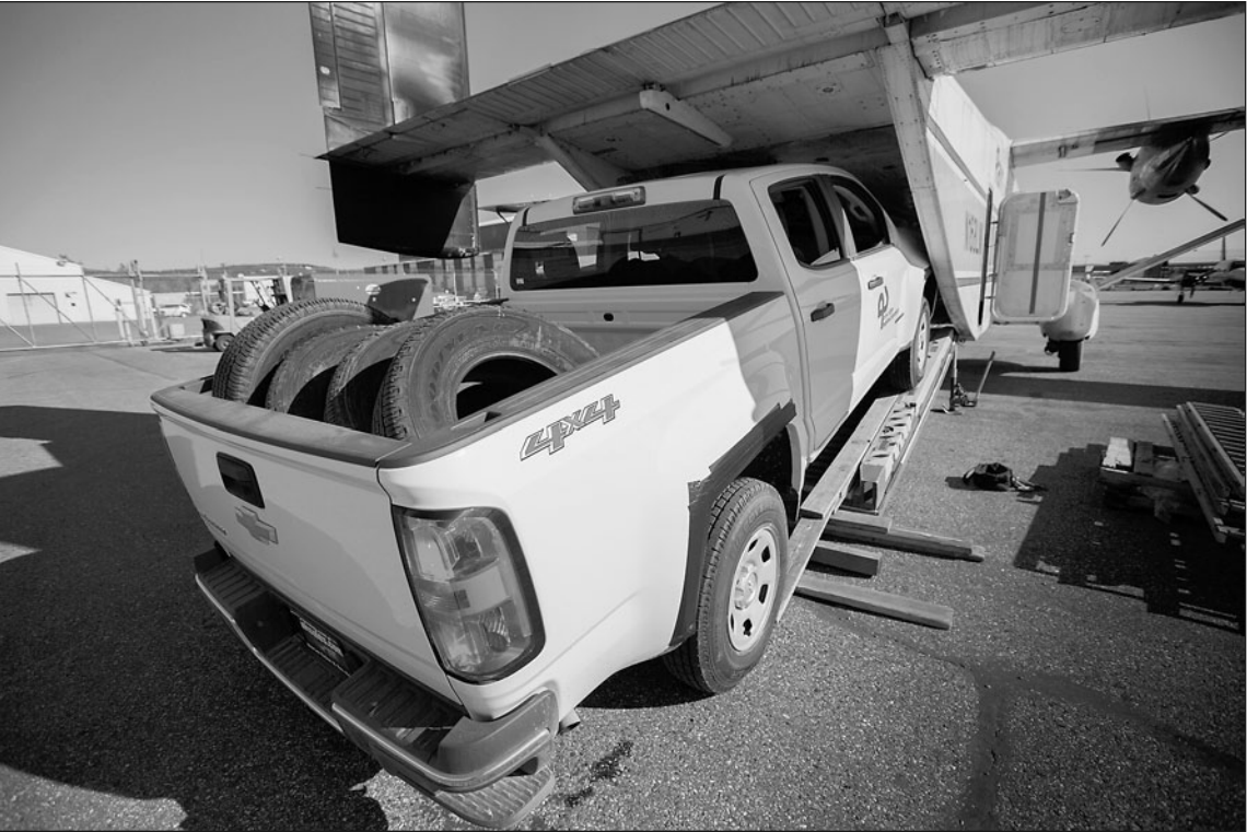
A 2015 Chevy Colorado is loaded on to a Shorts 330 Sherpa plane to be delivered to a village in Alaska.