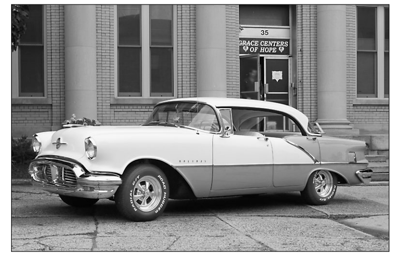
This classic Olds will be raffled off to raise money for Grace Centers.

Grace Centers of Hope provides a comprehensive range of programs and services to help in-