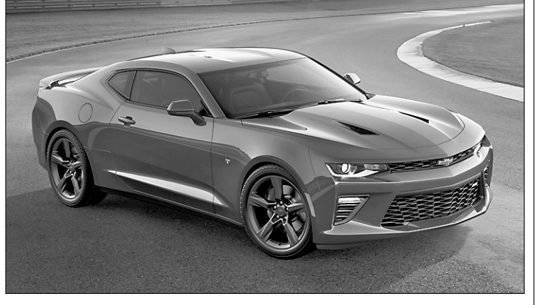
The sixth-generation Camaro has been introduced to the public.