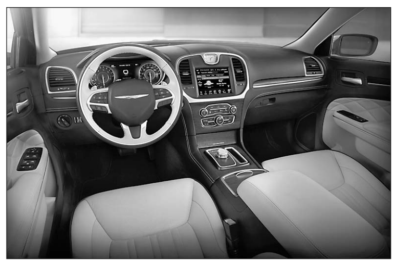
The prize-winning Chrysler 300 Plainum interior