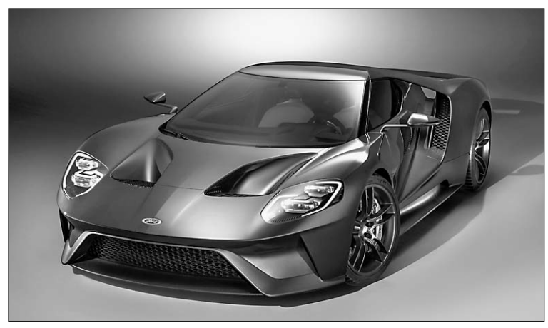
first examines the science of light The New Ford GT's style inspires designs outside the auto industry.

The Ford exhibition is on display at the Ford Design Lounge, pavilion 13 of Fiera Milano exhibition hall. The panel discussion also takes place at Fiera Milano. "FAVILLA, Every Light a Voice" is open to the public in Piazza San Fedele.