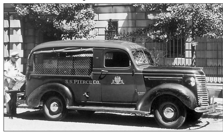
1939 Chevrolet Half Ton Canopy Express

Both vehicles were forerunners of the all-new Chevrolet City Express, Wheeler said, a smaller, maneuverable cargo van that, like its predecessors, gives com-