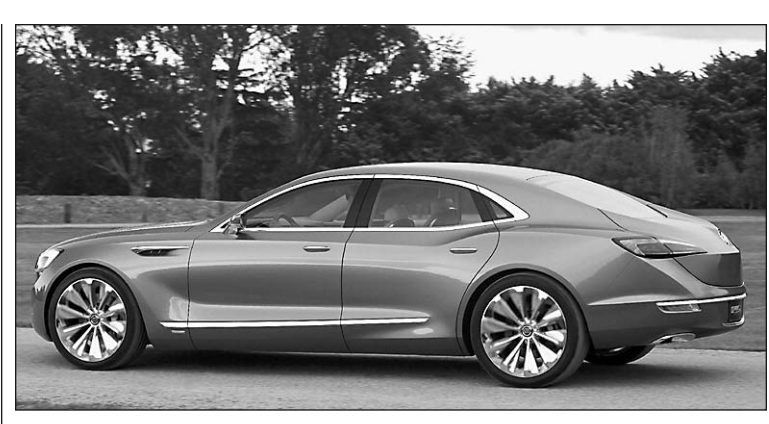
Buick Avenir Concept