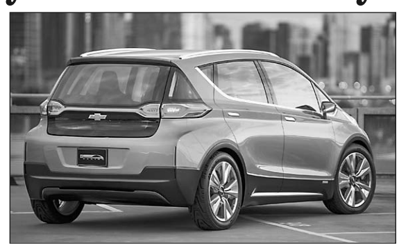
GM has made the decision to make the concept car 2015 Chevy Bolt, here seen from front and back, a reality.