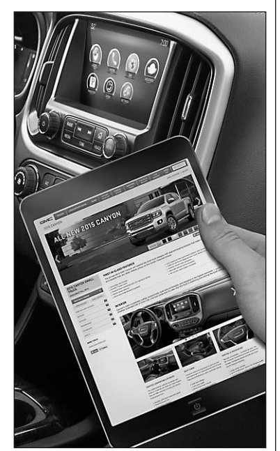
Cars' wi-fi vulnerable to hacking?