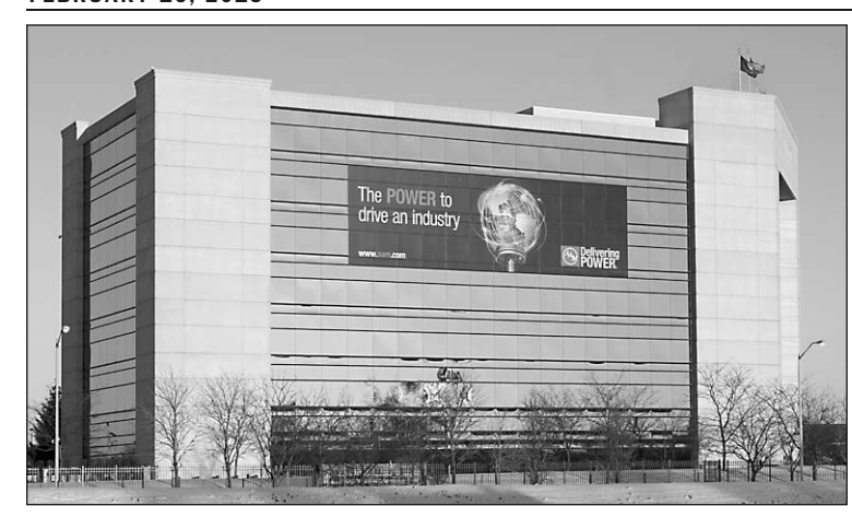
The AAM world headquarters in Detroit with its building wrap