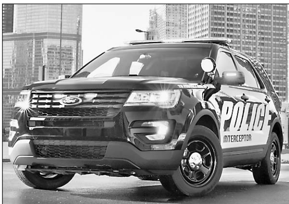
The 2016 Ford Police Interceptor Utility