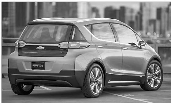
GM has made the decision to make the concept car 2015 Chevy Bolt, here seen from front and back, a reality.