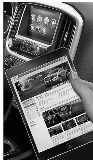
Cars' wi-fi vulnerable to hacking?