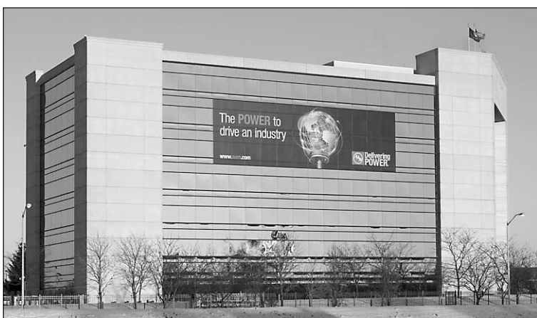
The AAM world headquarters in Detroit with its building wrap