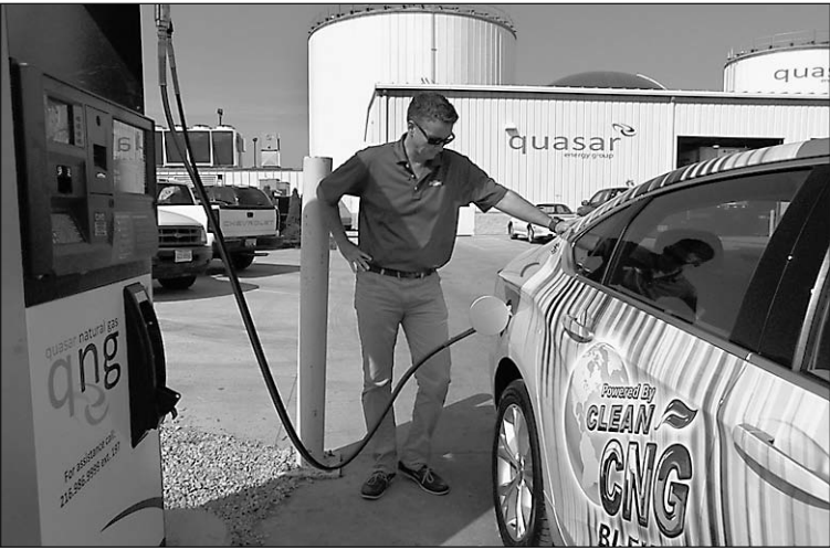
Fueling a 2015 Impala with CNG