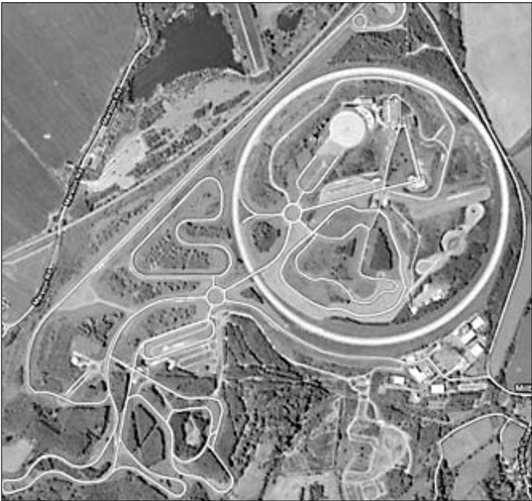
An aerial view of the Millbrook proving ground in England

"The new facility replicated many of the most successful fea-