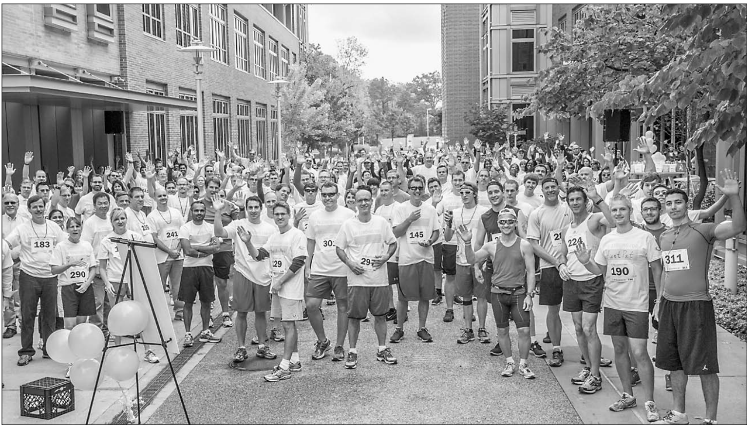
Visteon employees donated, then got ready to run – or walk – in the “Striding to End Breast Cancer” event during Breast Cancer Awareness Month.

"This new research clearly demonstrates how important experience is to safe driving."