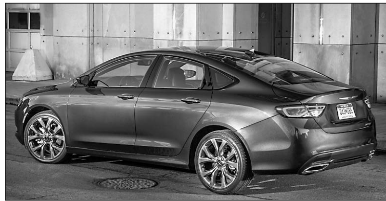
2015 Chrysler 200