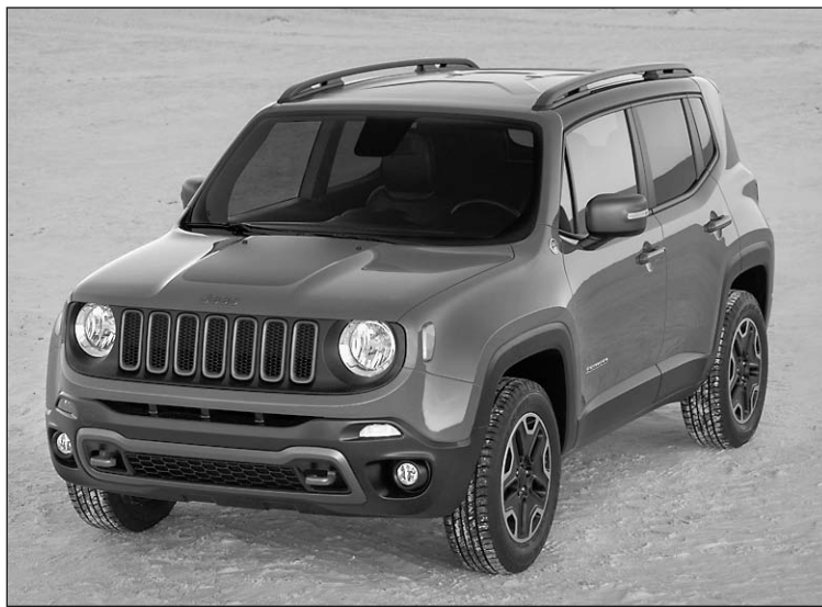
2015 Jeep Renegade

For the year to date, FCA sales totaled more than 588,000 vehicles (up 2.6 percent year-over-year) and market share was 20 basis points lower at 5.9 percent.