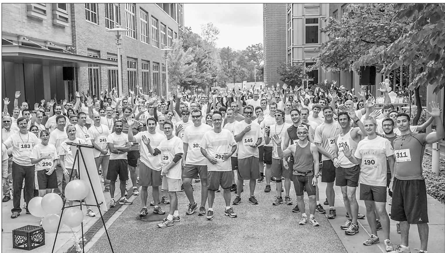
Visteon employees donated, then got ready to run - or walk - in the "Striding to End Breast Cancer" event during Breast Cancer Awareness Month.

"This new research clearly demonstrates how important experience is to safe driving."