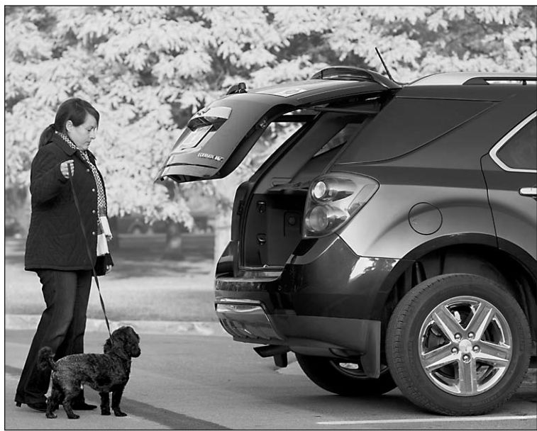
Equinox offers cargo room for vacationers to take pets with them.

As with children, never leave any pet alone in the car, Adams said. On a warm, sunny day, even with the windows open, a parked vehicle can become dangerously