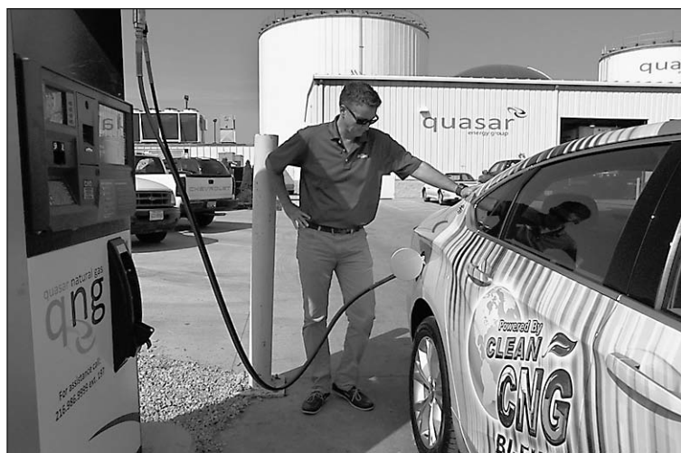
Fueling a 2015 Impala with CNG