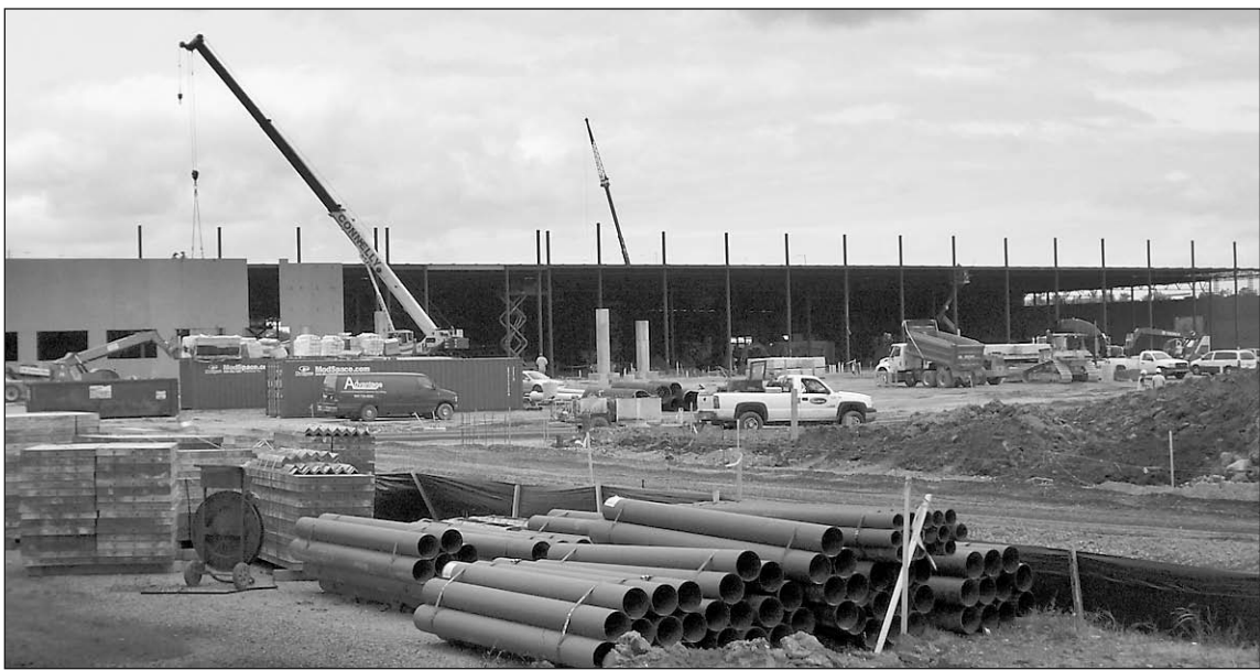
Construction of Menards store is under way at the site of the former golf dome, Van Dyke Sports Center.

"We will begin accepting job applications once we have man-