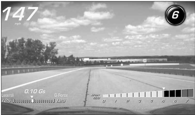
Valet Mode in action

Finally, the system features a dedicated SD-card slot in the glove box for recording and transferring video and vehicle data. An 8-gigabyte card can