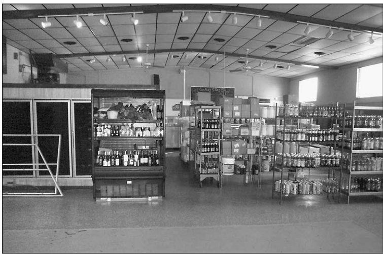
Recent flooding in Warren resulted in C.J.'s shutting down indefinitely.