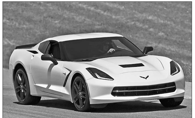
2015 Corvette Stingray

The greater performance and efficiency enabled by the available, GM-developed Hydra-Matic