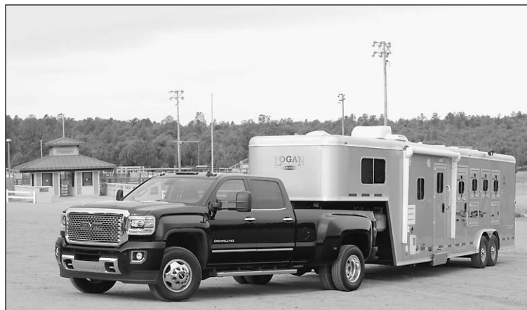
2015 GMC Sierra 3500 HD