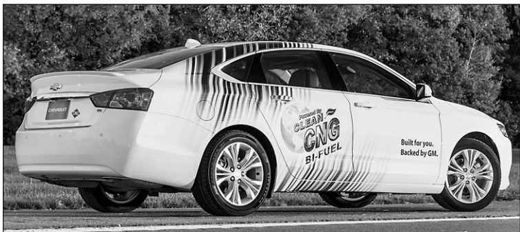
The 2015 Chevrolet Impala bi-fuel will have a CNG option.