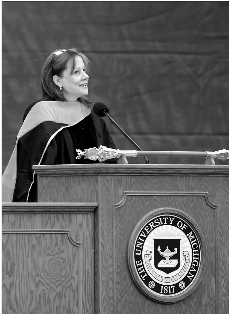
GM's Mary Barra speaks to U-M graduates about their futures.

"Remember: hard work beats talent – if talent doesn't work hard. So, don't be content to work around the edges of your profession. Don't wait to be invited to important meetings, or asked to work on critical assignments. Instead, do whatever it