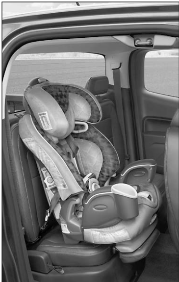
Child restraint in 2015 Canyon

In addition to this patent-pending design, Bugelli said, the new Canyon will be the first midsize