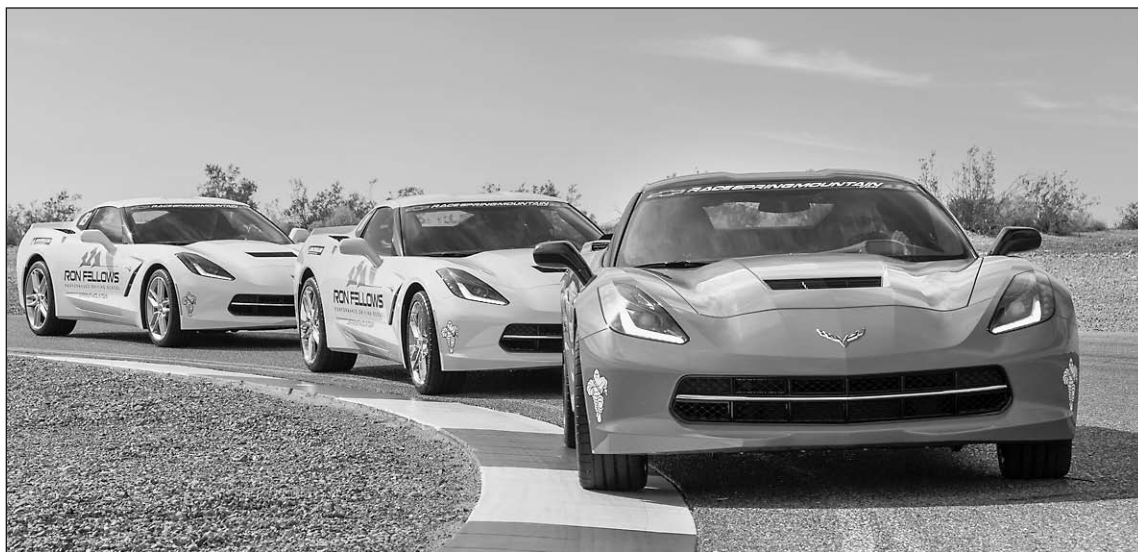
Stingray owners at the Ron Fellows Performance Driving School in Pahrump, Nev.

“It’s great fun – and drivers will definitely challenge their limits