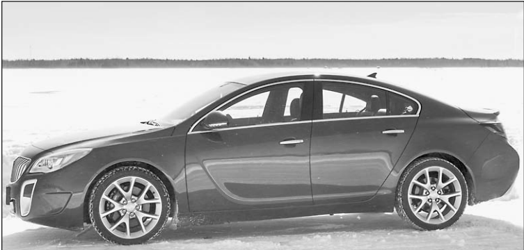
2014 Buick Regal

An active Haldex module directs drive to the rear wheels, Walter said. This system uses an electronic limited slip differ-