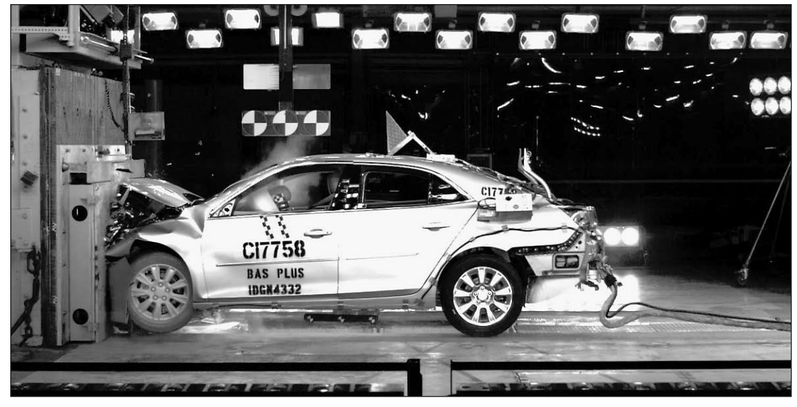
The 2014 Chevrolet Malibu received NHTSA's highest possible 5-star Overall Vehicle Score for safety.

COVERS THE TECH CENTER AND THE IMMEDIATE AREA