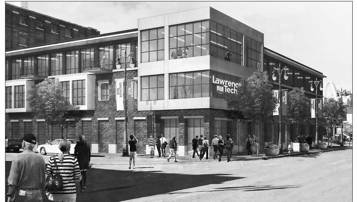
A rendering of the under-construction MDI building

tecture, design and urban issues. The first phase of the Detroit Center for Design + Technology will provide approximately 8,000 square feet for these and other programs, research activity and a K-12 educational outreach pro-