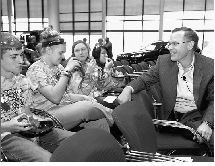
Chernoby talks with students.