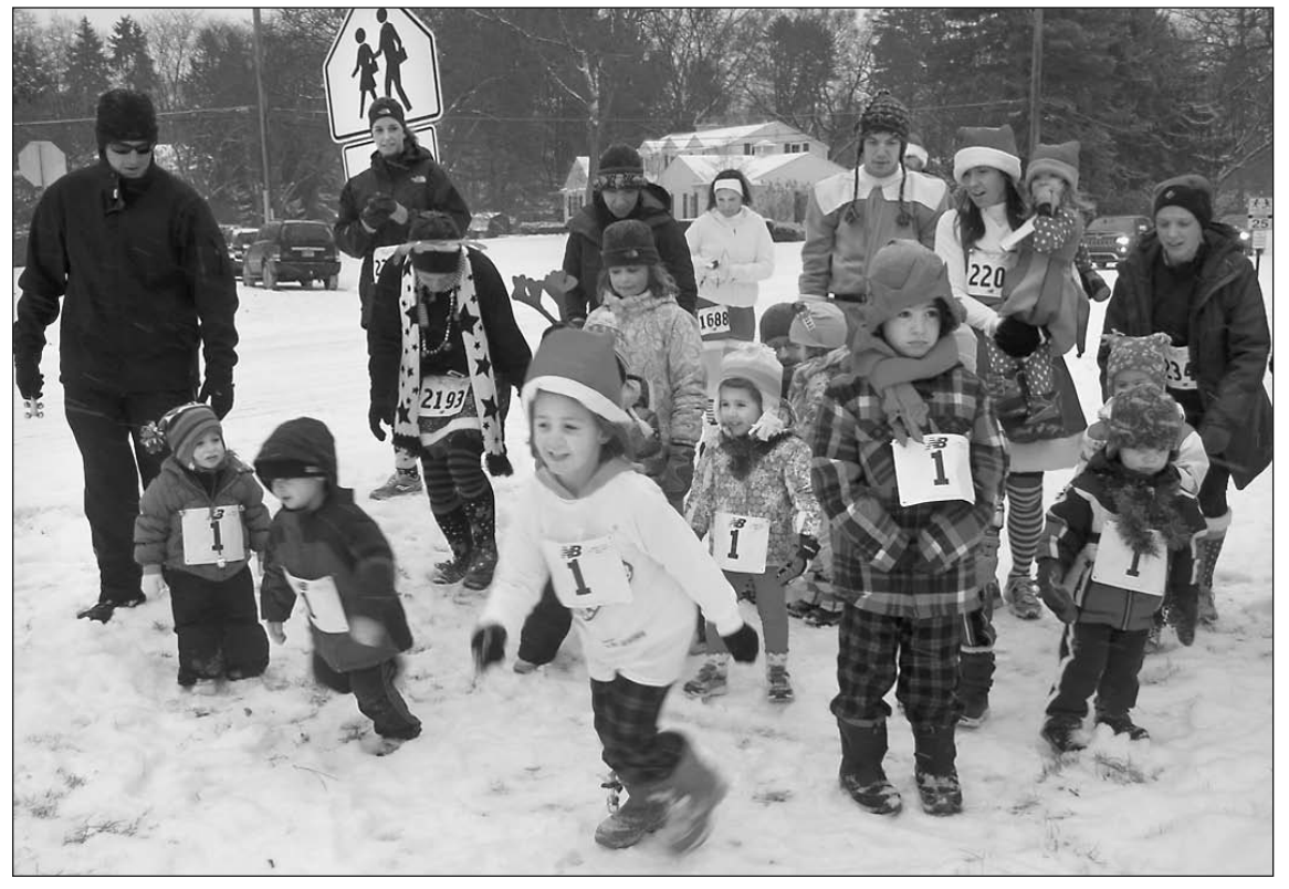
More than 40 kids participated in the Jingle Bell Run/Walk for Arthritis Snowman Shuffle, a 1/4-mile run.