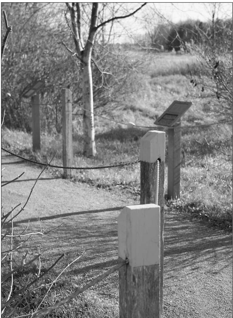
The McLaughlin Bay Wildlife Reserve on the grounds of GM Canada.

"We work with local schools, non-governmental organizations, non-profits and environmental preservation groups to enhance habitats in the communities in which we oper-